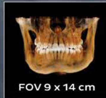
FOV 9 x 14 cm

Schedule a demo today at go.kavokerr.com/401375