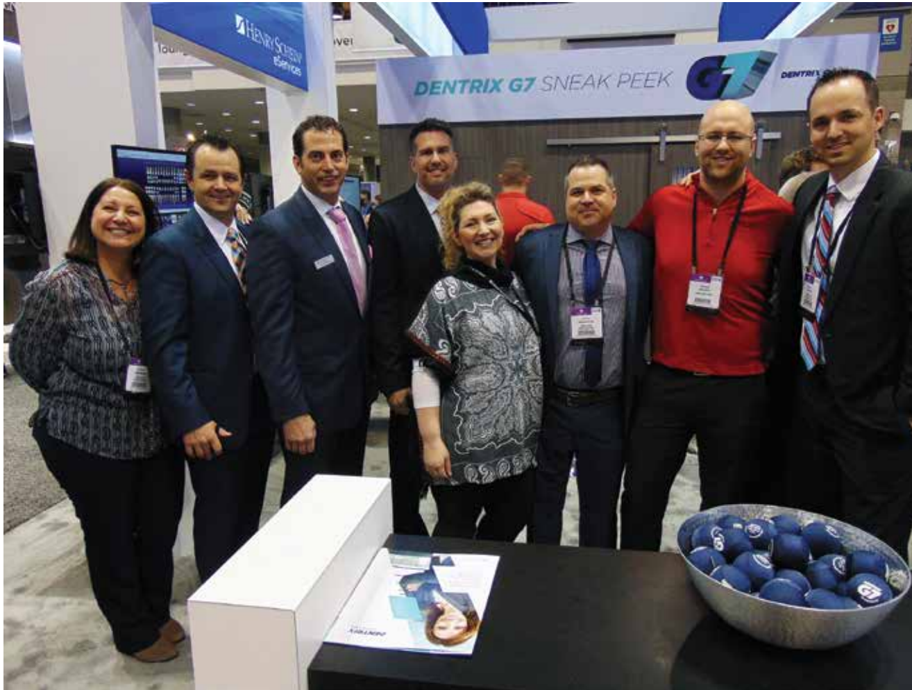
• The folks from Henry Schein eServices (booth No. 2819) are eager to tell you about Dentrix G7.