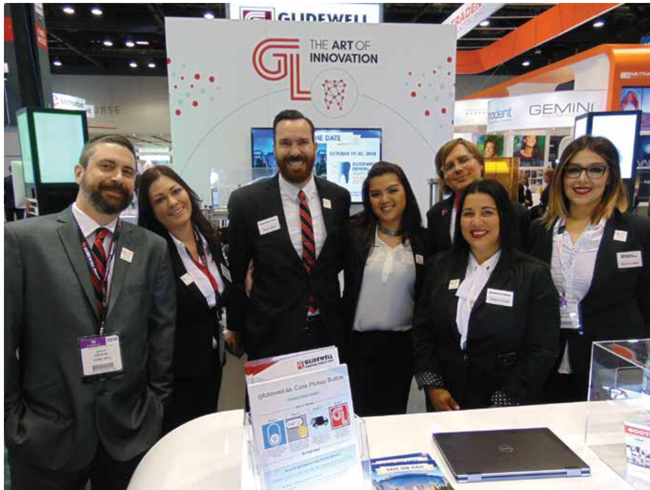
• There are big smiles all around among the team at Glidewell Dental (booth No. 4016).