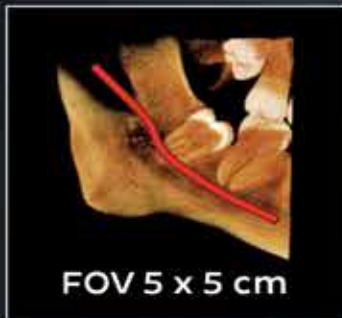
FOV 5 x 5 cm

From endo to airway studies, the new KaVo OP™ 3D is a flexible and affordable system that makes obtaining the right image achievable. With an intuitive interface, automated protocols, and customizable fields of view—plus the ability to take standard or pediatric 2D panoramic images, the KaVo OP 3D is the right system for your practice, both now and in the future.