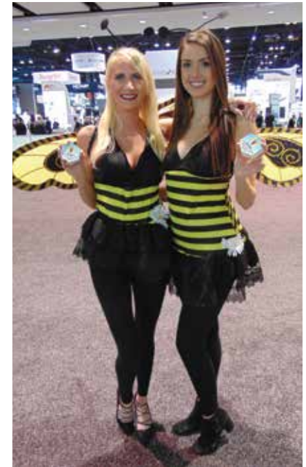
• To learn about a PDL injection without the needle, visit NumBee (booth No. 628). It's all the buzz, according to these busy bees who were buzzing about the exhibit hall Thursday morning.