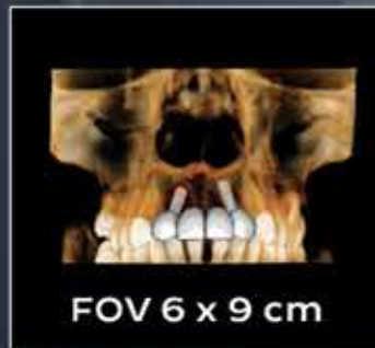
FOV 6 x 9 cm