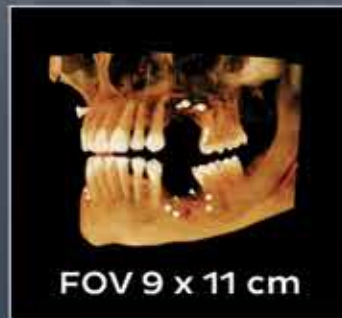
FOV 9 x 11 cm