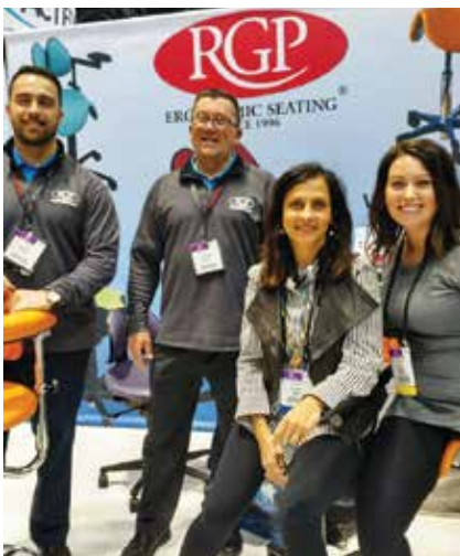
• Drop by the RGP booth, No. 3315, to test out some new chairs for your practice.