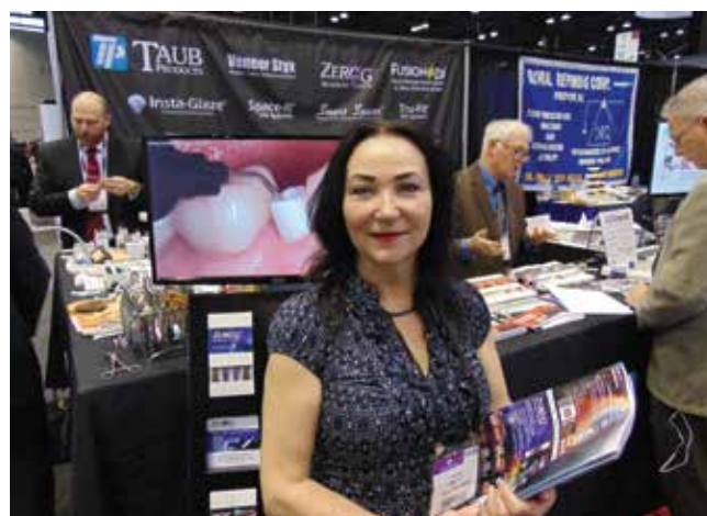
• A number of new and innovative offerings are available at TAUB Products (booth No. 1911).