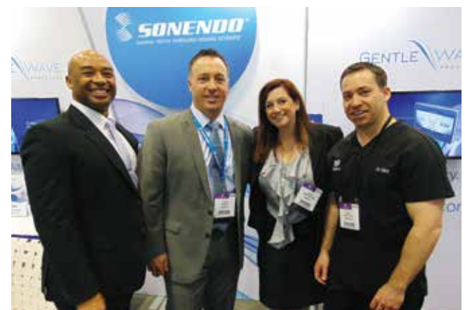
• The experts at Sonendo (booth No. 1229) are on hand to tell meeting attendees about the GentleWave technique for endodontic disinfection.