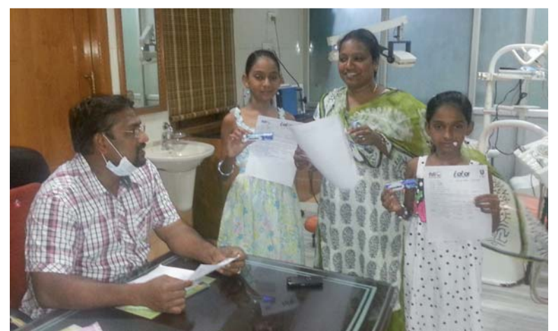
Photo showing an Indian family participating in the screenings.

In an initial check-up, the partnership project has screened over 5,000 participants and collected information on the frequency of their tooth brushing and their visits to the dentist, as well as their use of fluoridated toothpaste.