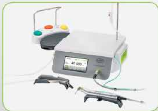
NEW Implantmed SI-1015 with wireless foot pedal option, Osstell ISO option and LED powered motor option