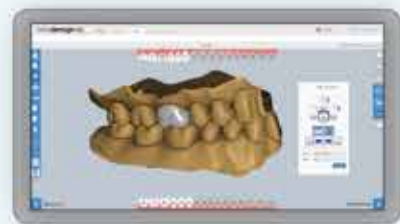
fastdesign.io ™ Software