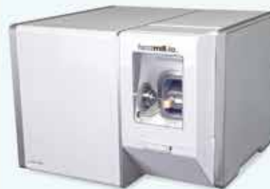
fastmill.io ™ In-Office Unit