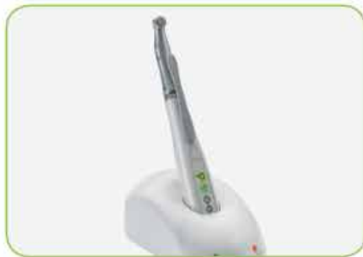
IA-400 Digital torque wrench