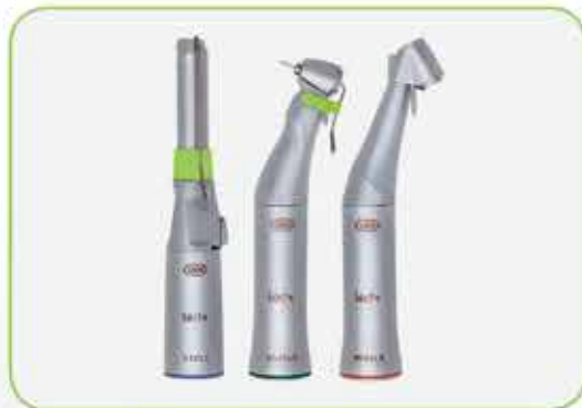
Surgical straight and contra-angle handpieces with or without Mini LED+