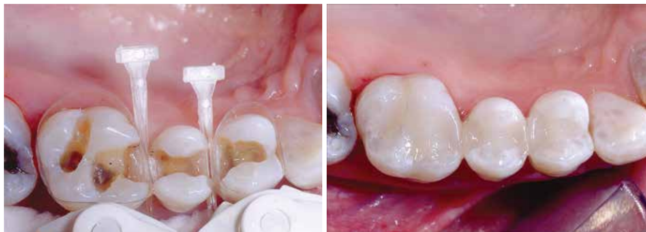
• Functional and naturally beautiful restorations created with Beautifil II LS.

Highly filled, 83 wt percent, Beautifil II LS demonstrates excellent compressive and flexural strength (ca. 370 MPa and 120 MPa, respec-