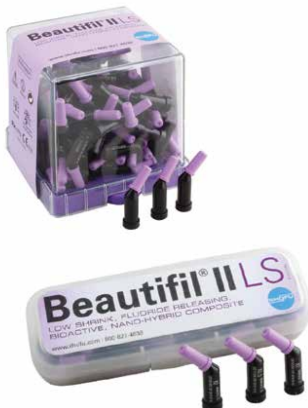
• Beautifil II LS.

tively), maintains ideal color stability and polishes in an instant, producing a long-lasting sheen, according to the company.