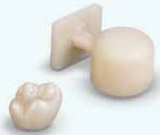
BruxZir ® NOW Fully-Sintered Zirconia

FREE* glidewell.io ™ Warranty 2-Year Extension (a $5,000 value) with Purchase