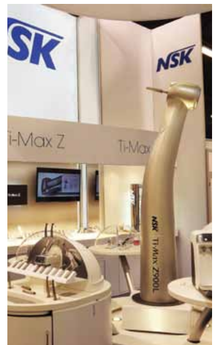
• Catch a glimpse of the giant Ti-Max 2900L at the NSK booth, No. 460.