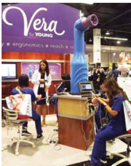
• Dental students try out the products at the Young Dental booth, No. 1430.