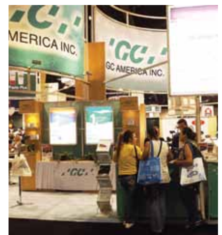
• GC America booth, No. 726, attracts attendees Thursday morning.