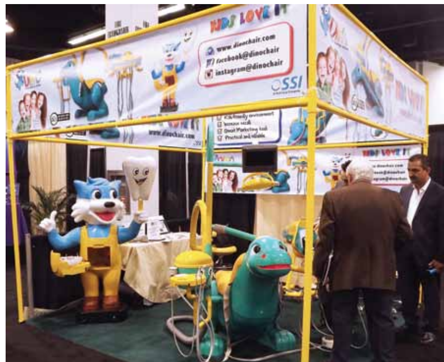
• Looking to brighten up your dental practice? Ossi Corp's Dino Dental Chair will have young clients flocking to your office. Check them out at booth No. 381.