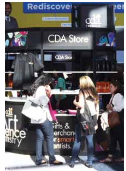
• Want to go home with some souvenirs of your trip to Southern California? Stop by the CDA Store in front of the exhibit hall for some CDA swag.