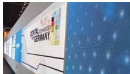
• The massive German Pavilion's science lab is impossible to miss in the 1300 aisle.

is Aböva Health in booth No. 940. The company is here from Italy with a product being introduced to the U.S. market: The Teethan dental contact digital analyzer, which is so new here,