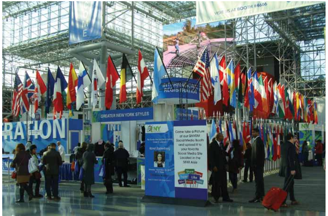
• Flags from around the world hang over the registration desk at the Greater New York Dental Meeting, signifying the meeting's global outreach.

Anchored by a scientific pavilion at booth No. 1313 and spanning across four aisles nearby, the German Pavilion encompasses more than 10,000 square feet and features more than 40 German dental companies (including