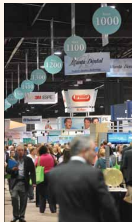
Expect nearly 400 companies in the exhibit hall; and new this year on the exhibit floor is a vintage car show.

presentation on Friday, March 22, on timeless principles.