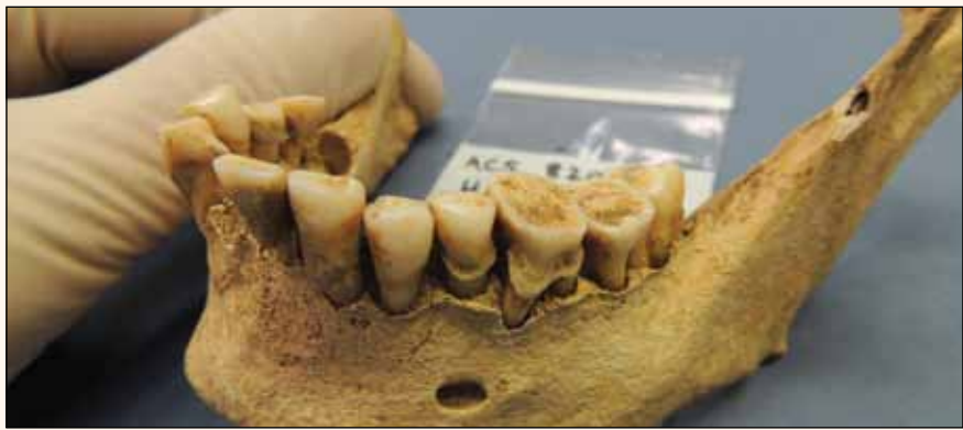
Teeth of late Iron Age/Roman adult female, recovered near Cambridge, United Kingdom, show large dental calculus deposits, which researchers describe as the only easily accessible source of preserved human bacteria.

Adler wrote, "One common cause of gum disease, porphyromonas gingivalis, had been suggested to lie behind recent rises in heart disease. However, we were able to show it had not increased in prevalence over the past 7,000 years, sug-