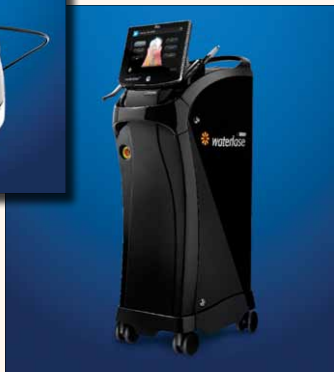
The WaterLase MDX and WaterLase MD Turbo are described as being ideal for practices seeking a basic, lower-cost entry point for all-tissue laser dentistry.