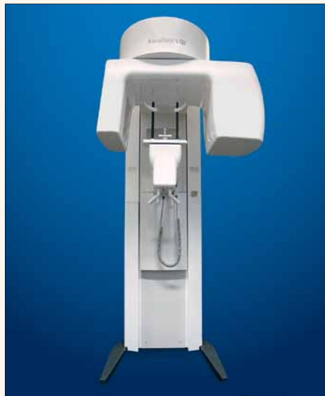
The NewTom VGi is reported to have the finest image quality of any CBCT system in dentistry, with a minimal dose of radiation to patients.