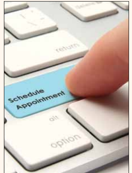
A digital patient communication system offers a secure site with a comprehensive list of online services, such as automated reminders, automated calling, invoice review and online payment.

The first step in acquiring new patients is making them aware of your practice. Be where your prospective patients are — online. This includes an optimized website, having an established presence in the social media world, and the ability