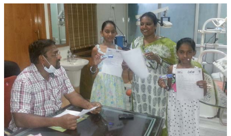
Photo showing an Indian family participating in the screenings.

In an initial check-up, the partnership project has screened over 5,000 participants and collected information on the frequency of their tooth brushing and their visits to the dentist, as well as their use of fluoridated toothpaste.