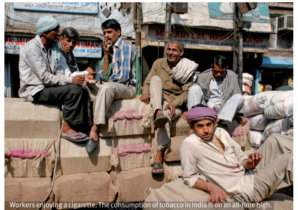
Workers enjoying a cigarette. The consumption of tobacco in India is on an all-time high.

As the available treatment centres are mainly located in the cities and have very few resources, patients