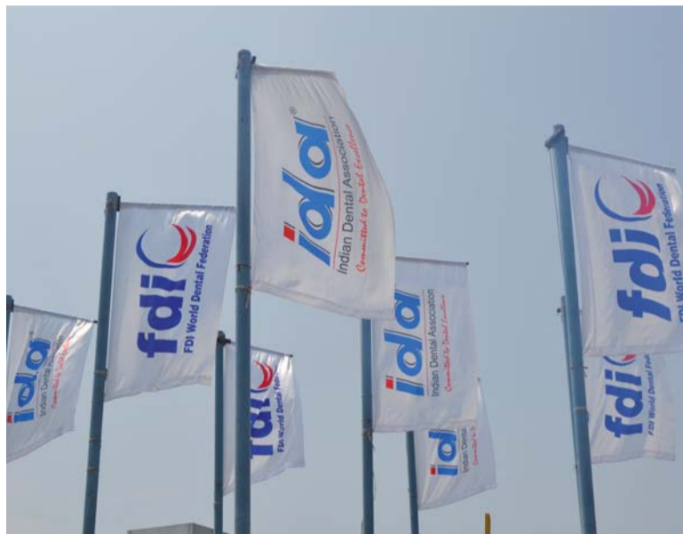
This year's AWDC is organised by the FDI in partnership with the Indian Dental Association.

It is the second time that India is hosting the prestigious dental event