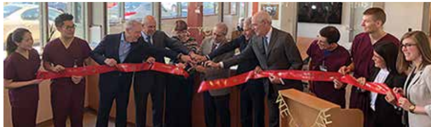
A ribbon cutting marks the opening of the Stephen Klein Wellness Center in Philadelphia.