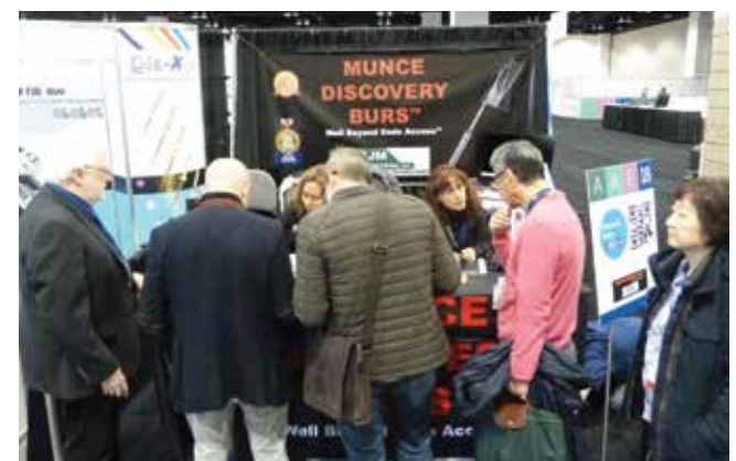
The counter at the Munce Discovery Burs booth (No. 726) is typically busy Wednesday morning.