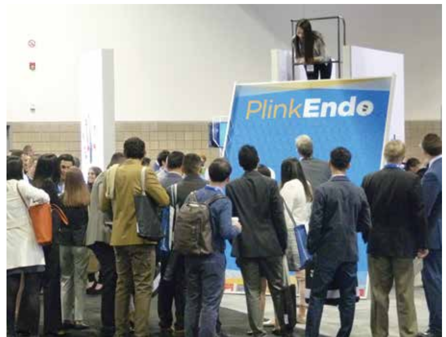
Collect up to four plinko chips at the Dentsply Sirona Endo booth (No. 509) and try your chances at a variety of prizes, including a Mavic Air Camera Drone.

If you go through the various stations in the Dentsply Sirona Endo booth (No. 509), you can collect up to four plinko chips to use on the booth's giant "PlinkEndo" board. Everybody wins