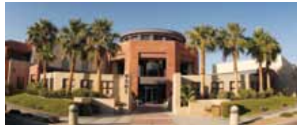
• The Las Vegas Institute for Advanced Dental Studies.

As a patient, I expect the best care I can find. As a doctor, I want