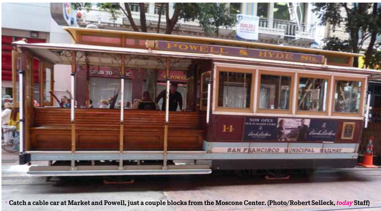
• Catch a cable car at Market and Powell, just a couple blocks from the Moscone Center.