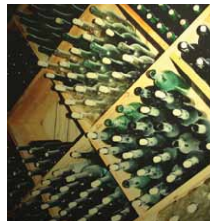
• Donate $20 and get a chance to pull a bottle of wine from the ‘wine wall.’

• CDA Foundation Scrubs. Visit the CDA Store and purchase CDA Foundation scrubs. Your purchase goes to support the work of the CDA Foundation.