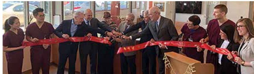
A ribbon cutting marks the opening of the Stephen Klein Wellness Center in Philadelphia.