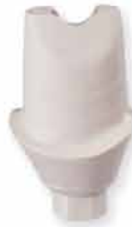
Custom temporary abutment included