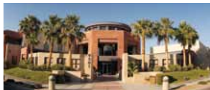
• The Las Vegas Institute for Advanced Dental Studies.

how to start the process of taking control of their practice and start to enjoy the full benefits of owning a practice and providing high-quality dentistry. Regardless of whether it is a solo practice or a group setting, every doctor can start the process of creating comprehensive care experiences for his or her patients.