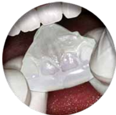
• Keystone's NiteBite.