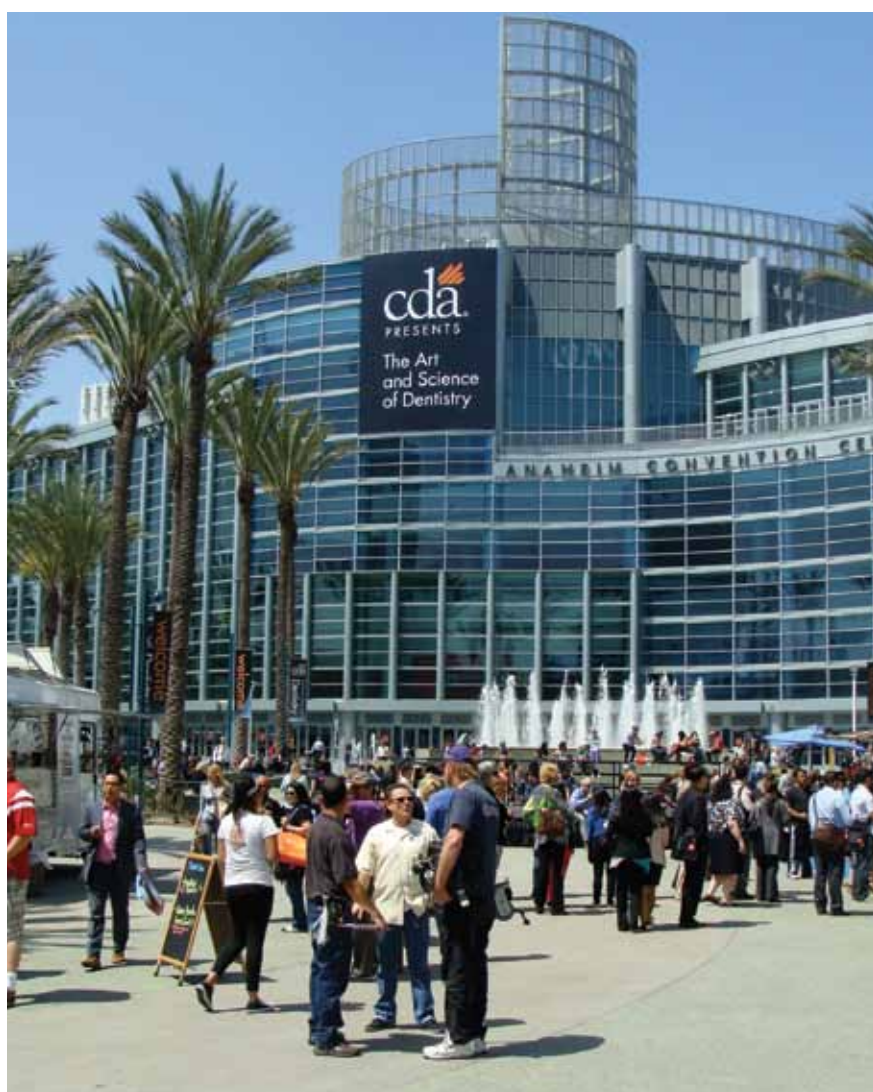
• Attendees mingle outside the Anaheim Convention Center during the 2013 CDA Presents.