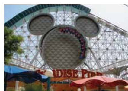
• The California Screamin' coaster at Disney's California Adventure.