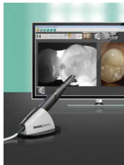
• The CariVu detection device.

natural tooth transparent and the caries dark, similar to radiographs, thus making it a view that is familiar to clinicians.