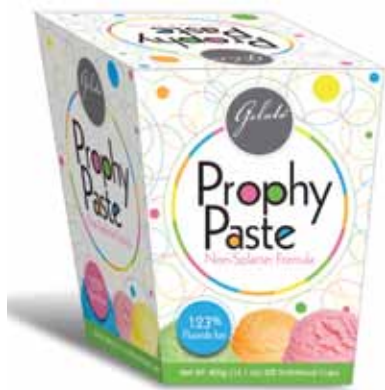
• Keystone's Gelato Propphy Paste.

The paste is available in four different grits (fine, medium, coarse and x-course) for various stain removal