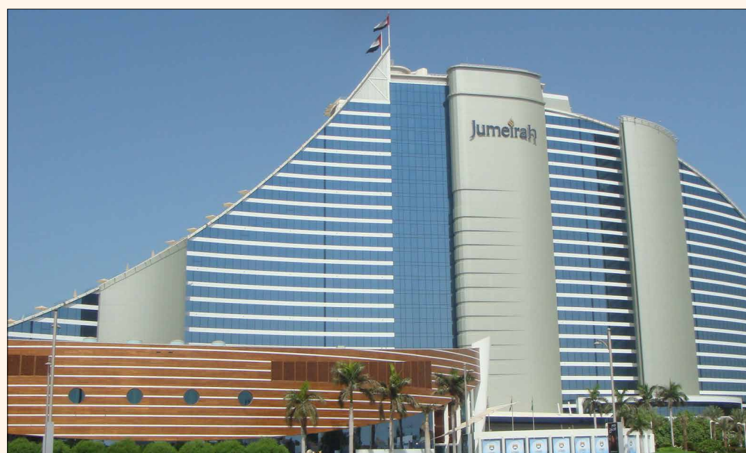
Jumeirah Beach Hotel Dubai, UAE

number of dental companies exhibiting in 2015 and over 125,000 dental professionals expected to attend the world's largest dental showcase. Those who missed the opportunity to travel to Cologne, do not fear, the latest news and technological advances will be showcased in Dubai,