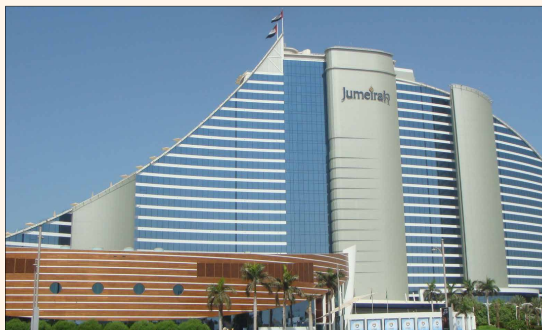
Jumeirah Beach Hotel Dubai, UAE

number of dental companies exhibiting in 2015 and over 125,000 dental professionals expected to attend the world's largest dental showcase. Those who missed the opportunity to travel to Cologne, do not fear, the latest news and technological advances will be showcased in Dubai,