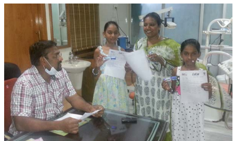
Photo showing an Indian family participating in the screenings.