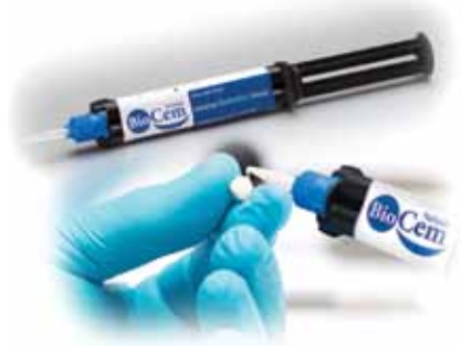
• NuSmile BioCem.