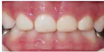
• Four ZR zirconia crowns at six months post-op.