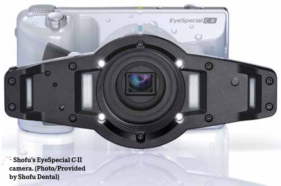
Shofu's EyeSpecial C-II camera.

The Shofu camera offers numerous features that facilitate in-office and peer-to-peer collaboration and patient education, according to the company. The LCD screen of the EyeSpecial C-II is larger than displays