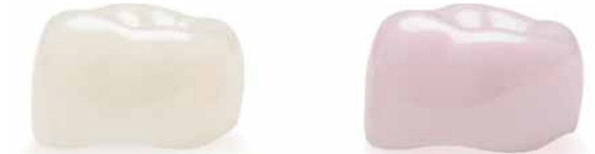
• Every NuSmile ZR zirconia crown, left, comes with a matching Try-In crown.

was develop a patent-pending process for manufacturing its NuSmile