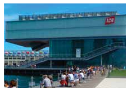
• The Institute of Contemporary Art.

• Institute of Contemporary Art: The ICA is Boston's first new art museum in more than 100 years. It features contemporary paintings sculptures and photographs, in addition to cutting-edge live dance and musical performances. Save $2 off regular admission. www.icaboston.org