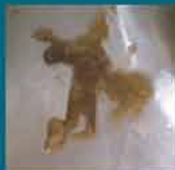
Actual photos of handpiece biofilm Dental unit waterlines can exceed bacterial allowance standards by as much as 20,000% due to biofilm buildup