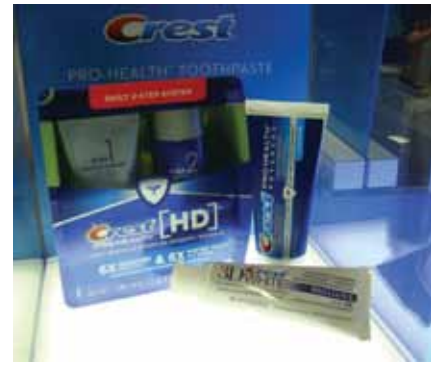
• Consumer products on display at Crest + Oral-B (booth No. 2501).