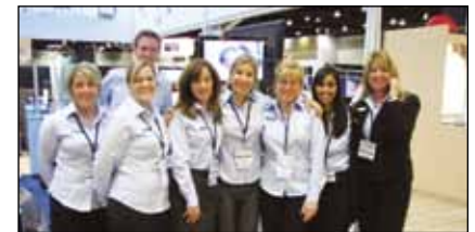
• The gang's all here at the Oral Sciences booth (No. 1029).