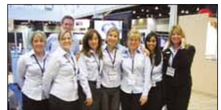
• The gang's all here at the Oral Sciences booth (No. 1029).