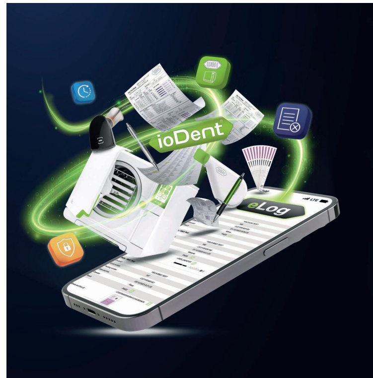
With the new eLog from W&H routine tests and recording of sterilization cycles can now be saved in a digital logbook.

This is what the new Helix test from W&H promises for type B sterilizers. It acts as a hollow body which, due to its physical shape, simulates the most difficult requirements for the sterilization of hollow body instruments. "The QR code on the test strips enables full