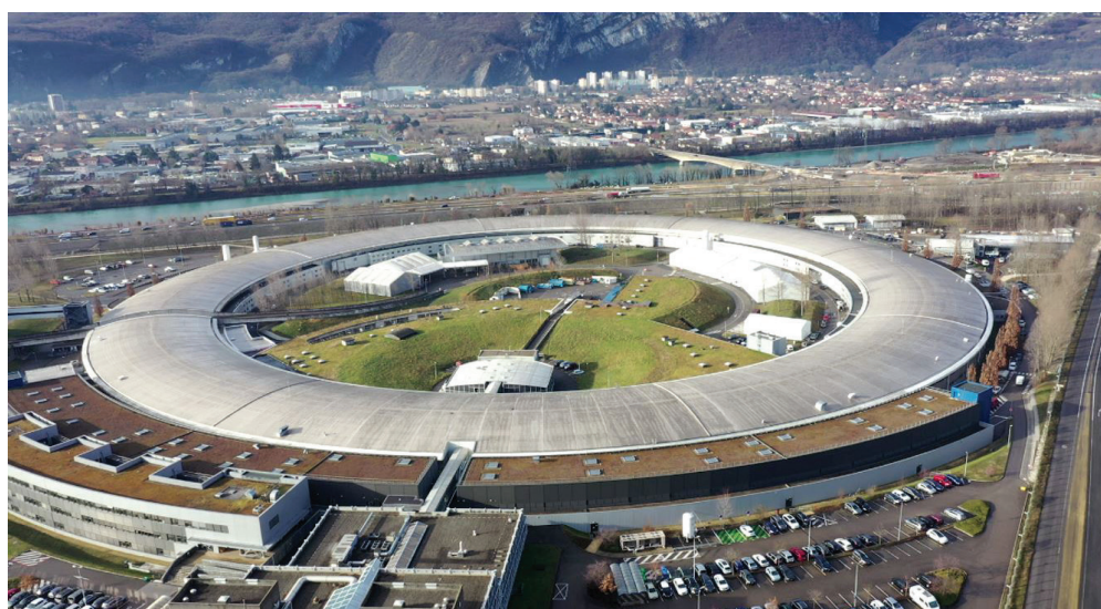
European Synchrotron Radiation Facility in Grenoble