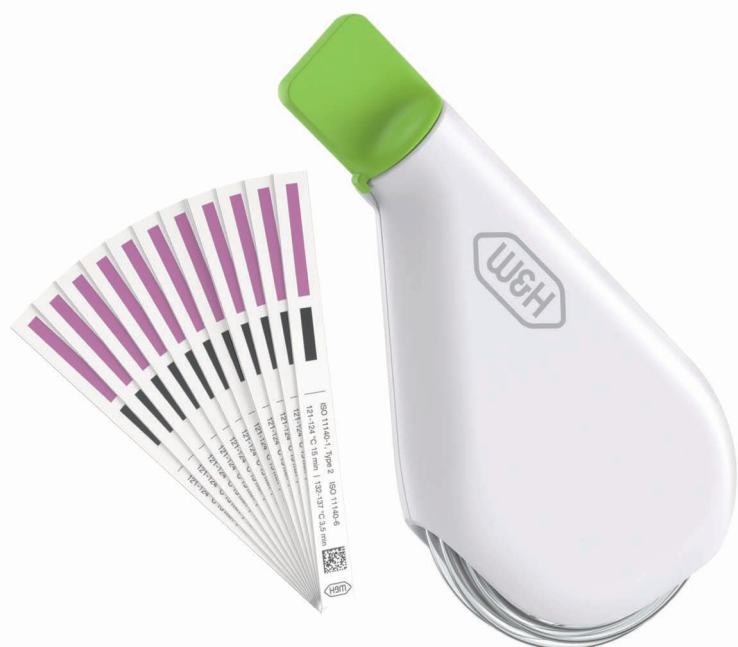
Reliability in routine monitoring promises the new Helix test from W&H for type B sterilizers.

More information on the new eLog system and the Helix test can be found online at wh.com .