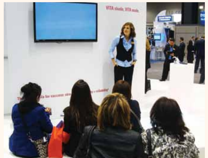
A presenter from Vident (booth No. 420) offers product information to meeting attendees.