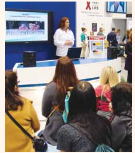
Meeting attendees listen to an educational presentation at Sunstar Americas (booth No. 4206).