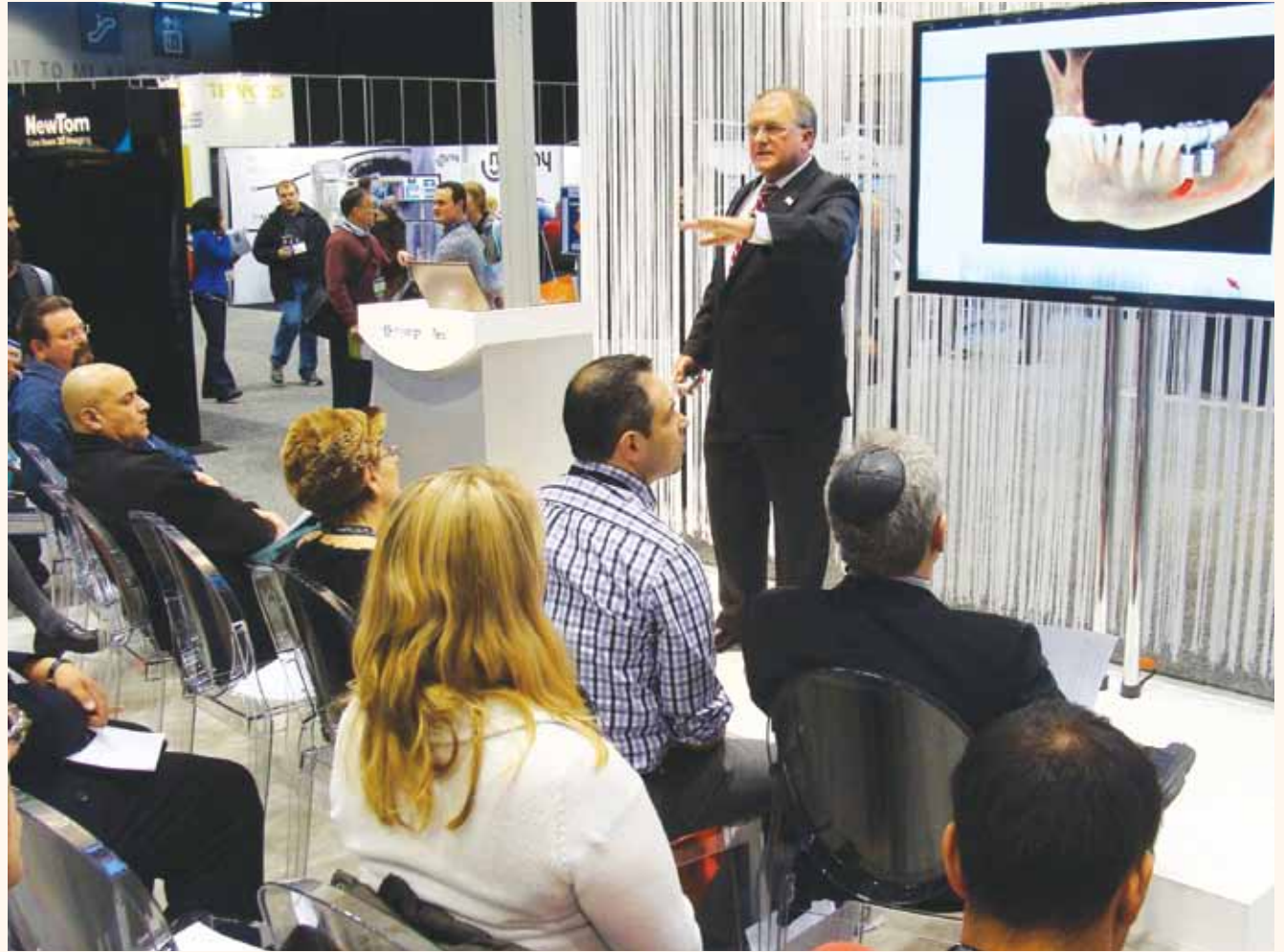
Meeting attendees sit down for an educational presentation at the booth of Invisalign/iTero (booth No. 1038).