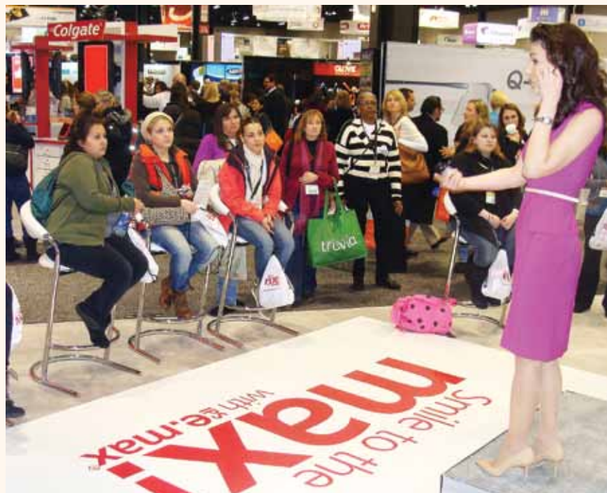
A presenter from Ivoclar Vivadent (booth No. 1417) offers product information on the show floor.