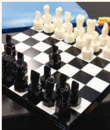
This chess set, available at Viade Products (booth No. 2219), features pieces that are replicas of teeth. Clever!