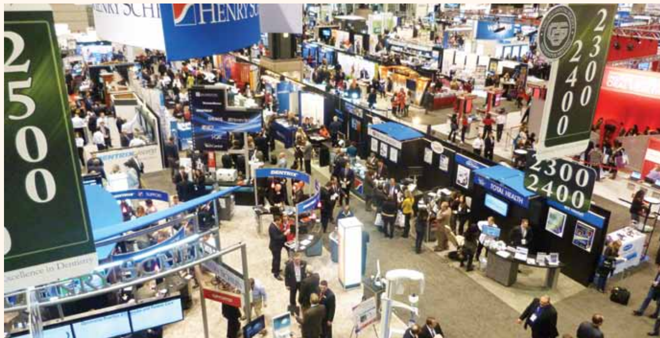
Attendees stream through the aisles of the Chicago Midwinter Exhibit Hall to check out the latest innovations from hundreds of exhibitors.