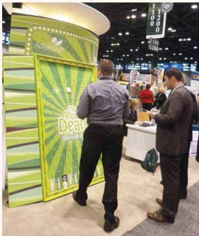
Information and games await you at the Patterson Dental booth (No. 1016) here at the Chicago Midwinter. While you're at the booth today, ask for a pass to the third annual Midwinter Madness, the 2013 dental convention after party at Enclave, 220 W. Chicago Ave. The pass is good for your whole group, and the event goes from 8 to 11 tonight.