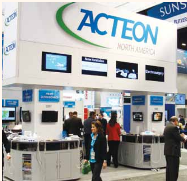
Acteon North America (booth No. 4007).