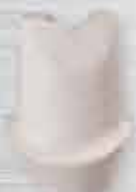
Custom temporary abutment included