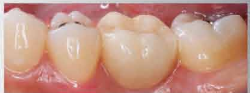
Buccal view of final restoration at delivery