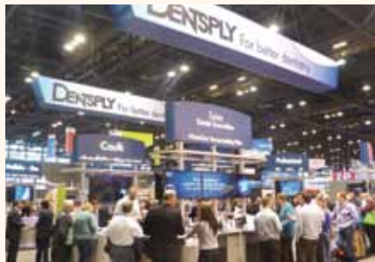
DENTSPLY's many divisions serve a variety of needs in the dental market, including implants, prosthetics and much more. Stop by the booth to learn more (No. 1802/2002).