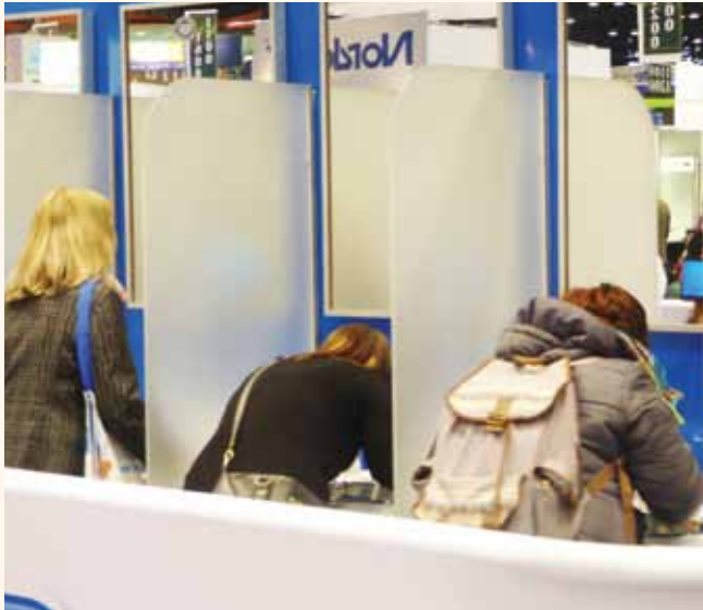
Chicago Midwinter attendees sample Crest Oral-B products at the booth's brushing stations (booth No. 605).