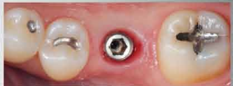
Contoured soft tissue sulcus after healing