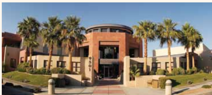
The Las Vegas Institute for Advanced Dental Studies in Las Vegas.

The Core I program at LVI is the first step on that journey. That's why when