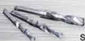
Surgical drills and Inclusive ® Tapered Implant included