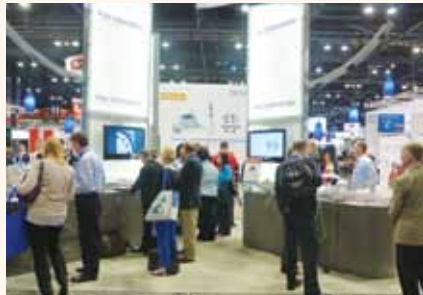
Attendees gather to hear the latest information at the Axis/SybronEndo booth (No. 3600/3801).