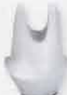
Final Inclusive ® Custom Abutment included