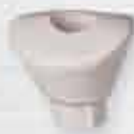
Custom healing abutment included