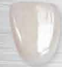
BioTemps ® provisional crown included