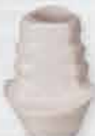
Custom impression coping included