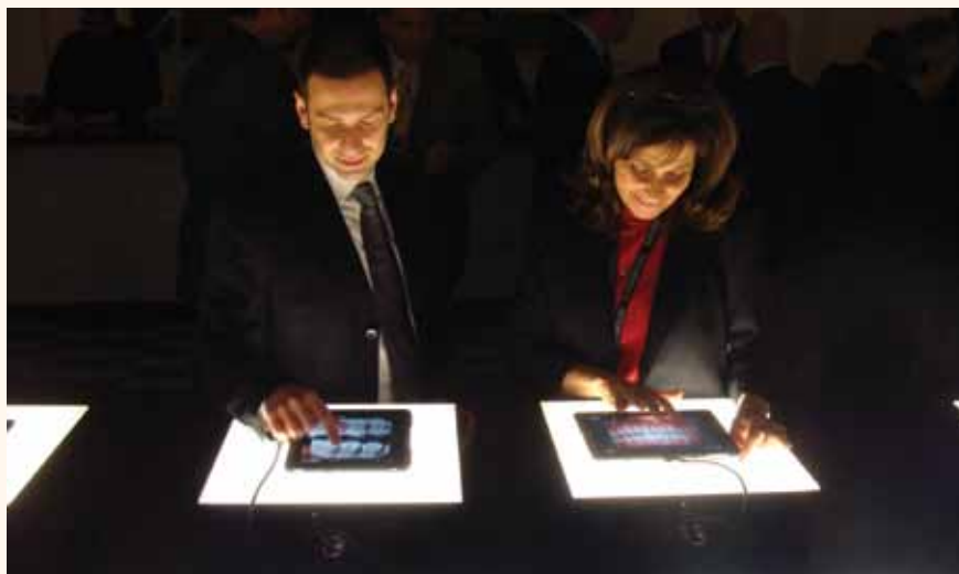
Event attendees take the opportunity to play around on iPads after the conclusion of the main presentations at the 'Art of Imaging' event.