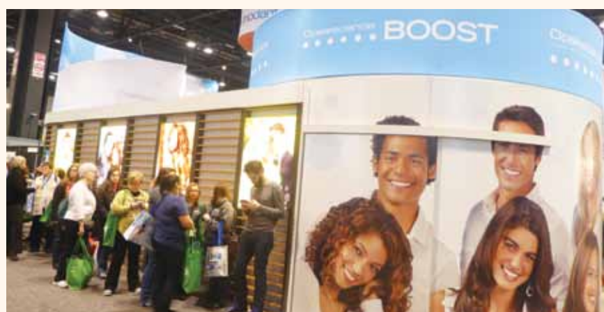
A long line formed at the Opalescence booth (No. 4418) as attendees wait to hear a presentation (and maybe get some samples, too!).