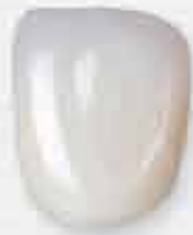
Final BruxZir ® or IPS e.max ® crown included