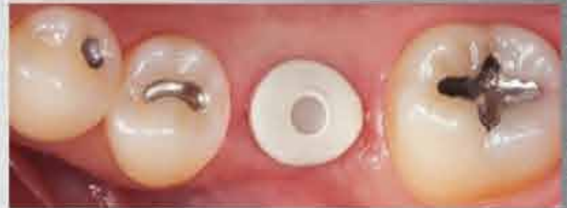
Inclusive custom healing abutment at implant placement