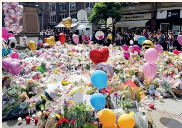
Floral tributes at St Anns Square in Manchester. The attack has left 22 people dead and over 50 injured.

"Quite rightly Manchester has resolved to carry on. Our thoughts are with all the families touched by this atrocity," he added.