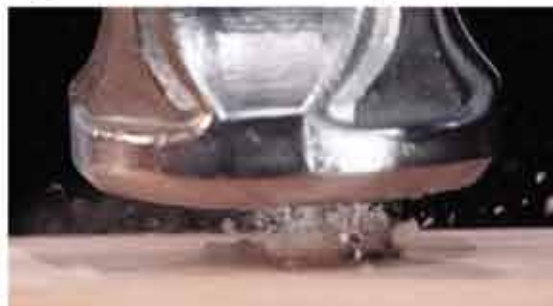
Crowns hit with sledgehammer