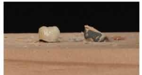
Obsidian (left), Ceramco3 (right)

*Price does not include shipping or applicable taxes. † Data provided by Glidewell Laboratories Research and Development Department, 2015. Ceramco is a registered trademark of DENTSPLY Ceramco.