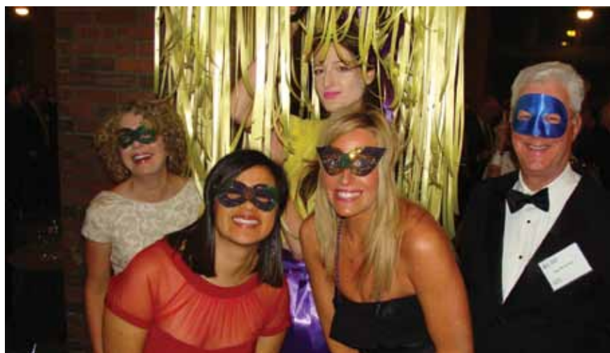
• Attendees have fun with this year's theme — Mardis Gras Redux.