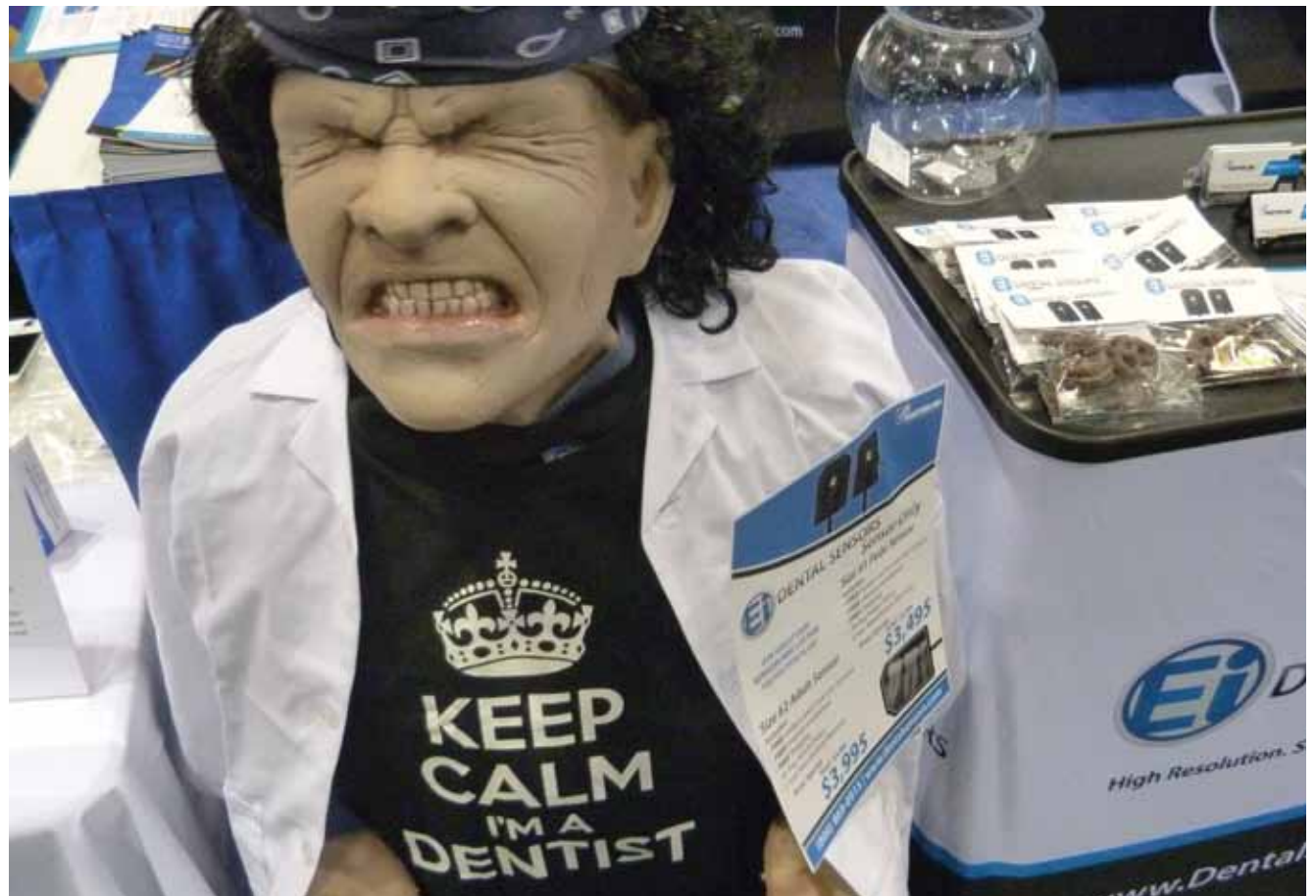
• Perhaps still frustrated by flight delays, the alleged dentist in the Clik Tech/Masterlink booth (No. 3742) grabbed attention from more than a few attendees in the exhibit hall on Thursday.