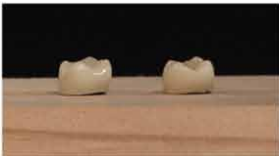
Obsidian (left), Ceramco3 (right)