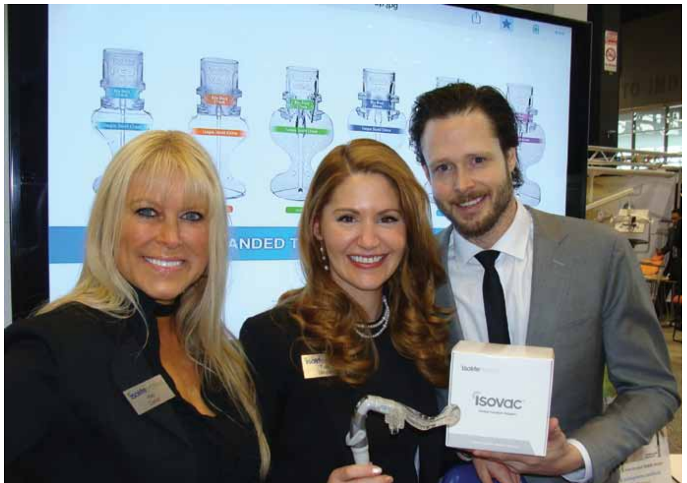
• The gang at Isolite show off the Isovac. Stop by the booth (No. 4631) for lots of fun demonstrations.