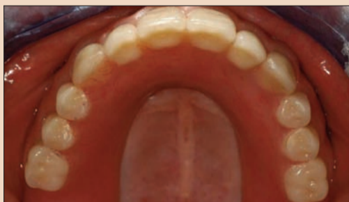
Fig. 8 B, Denture placed over bar retainer.