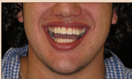
Fig 4 B, Finished result.