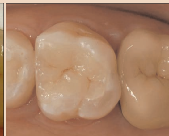
Fig 2 B, Bonded porcelain inlay.