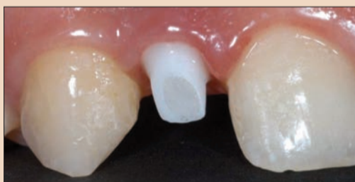
Fig. 5 B, A zirconia abutment has been attached to the implant with a screw