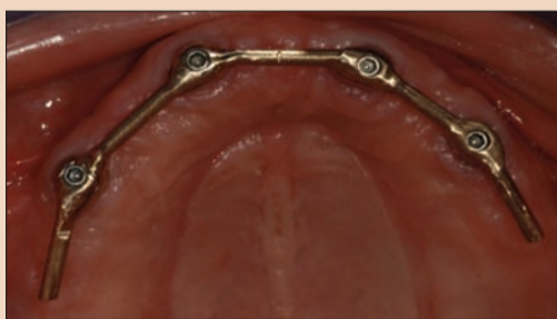
Fig. 8 A, Bar retained by 4 implants provides retention and support for up-per complete denture.