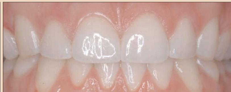
Fig 1 B, Finished result. Note that the spaces between the teeth have been closed with the veneers.

Posterior teeth with large cavities or old defective restorations can be restored with porcelain inlays (restorations that fit within the tooth structure) or onlays (restorations that cover one or more cusps of the teeth). These restorations can be hand-made by a technician or milled with computer-assisted design/computer assisted machining (CAD/CAM) technology. The