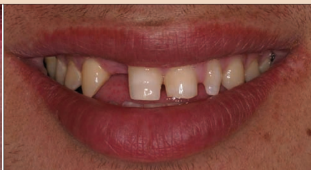
Fig 4 A, Teeth before placement of all-ceramic bridge and three all-ceramic crowns.