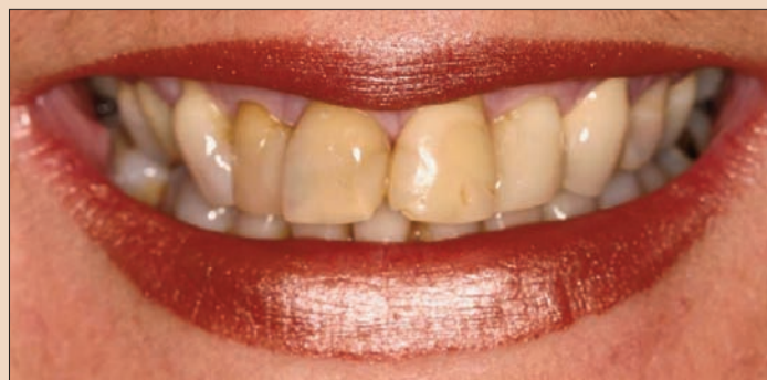
Fig 3 A, Teeth before placement of all-ceramic crowns.