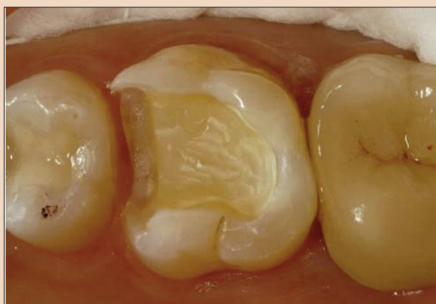
Fig 2 B, Molar with large cavity prepared for porcelain inlay.