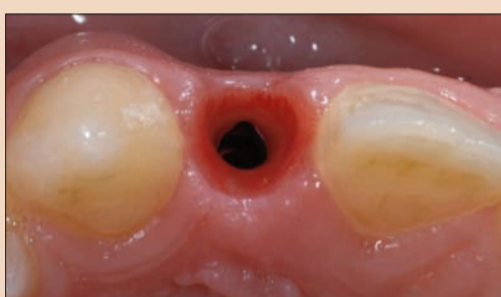
Fig 5 A, An implant has been placed beneath the gum and in the bone to replace the missing right lateral incisor tooth.