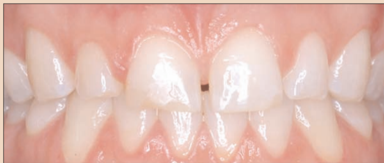
Fig 1 A, Discolored teeth with structural defects.

Discolored teeth or teeth with minor structural defects can be restored with porcelain laminate veneers. Veneers are very thin porcelain restorations that are bonded to the teeth. Well made and well placed veneers can be strikingly beautiful (Fig 1).