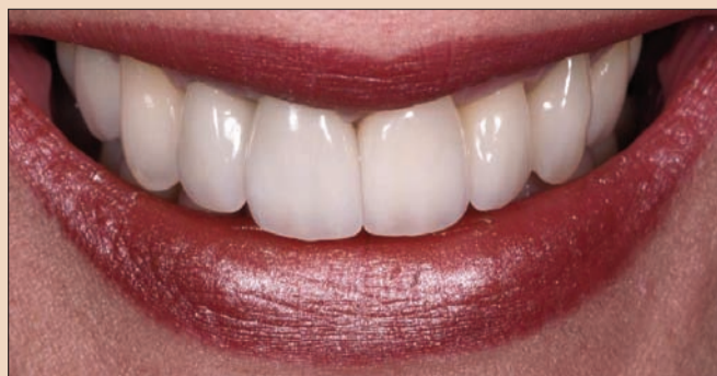
Fig 3 B, Teeth with all-ceramic crowns in place.