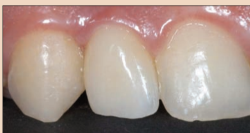
Fig. 5 C, An all-ceramic crown has been cemented over the abutment.