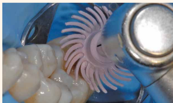
Fig. 8: The initial finishing was completed with Sof-Lex™ Discs, followed by pre-polishing with Sof-Lex™ Pre-Polishing Spiral and high gloss polish with Sof-Lex™ Diamond Polishing Spiral.