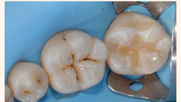
Fig. 6: Dentin was replaced with incremental placement and curing of Filtek™ Z350 XT Universal Restorative, shade A3B.