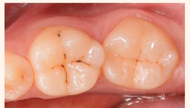
Fig. 9: Final restorations with an excellent esthetic appearance.