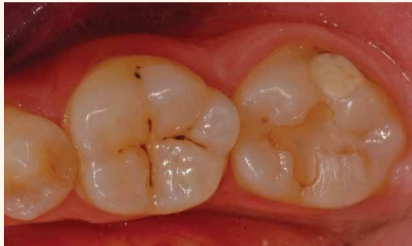
Fig. 1: Initial situation: mandibular second molar with restorations require replacement.