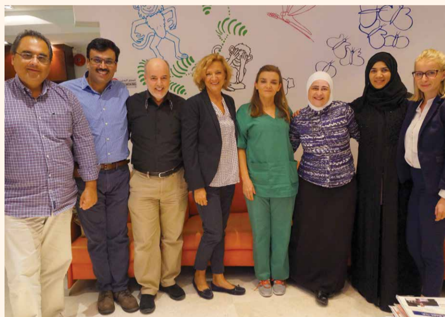
►Page 2 Board Members of the Emirates Paediatric Dentistry Club and CAPP Team Members (the Organizer)