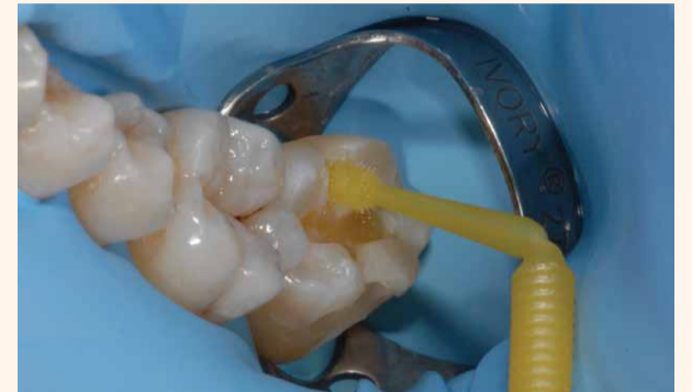
Fig. 3: After selective enamel etching, Single Bond Universal Adhesive was applied.