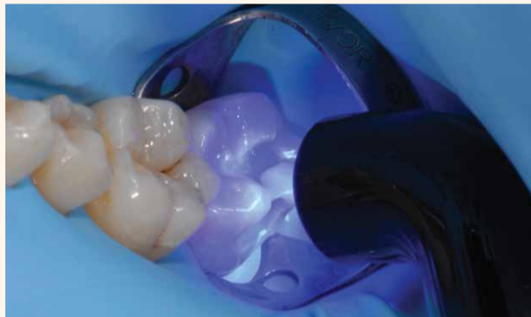
Fig. 4: Adhesive was cured for 10 seconds with Elipar™ DeepCure-S LED Curing Light after scrubbing and air drying steps were completed.