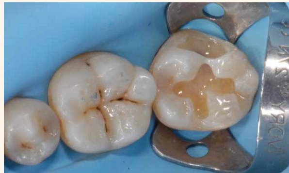
Fig. 5: Filtek™ Z350 XT Flowable Restorative, shade A3 was used as a liner for easy adaptation.