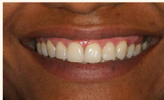
Figure 5: The patient's smile 10 days after the laser deepithelialization and crown lengthening