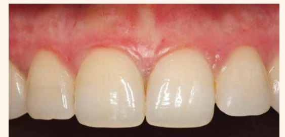
Figure 4: 10-days postoperative, rapid healing with dramatic results in gingival colour