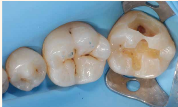
Fig. 2: After placement of rubber dam the insufficient fillings were completely removed.