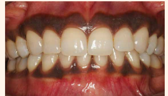
Figure 2: Retracted, preoperative, intraoral view demonstrating the degree of pigmentation and extension of the affected areas