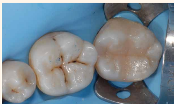
Fig. 7: Enamel was replaced with Filtek™ Z350 XT Universal Restorative, shade A3E and light cured. Stains were applied in the fissure.