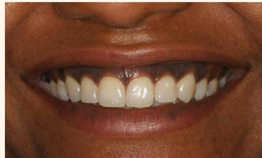
Figure 1: Preoperative view of the patient's smile