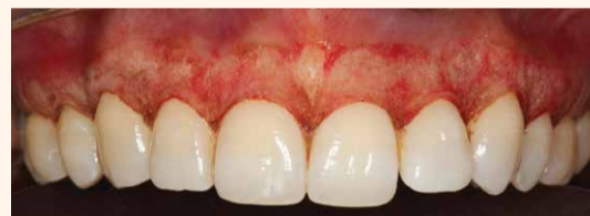
Figure 3: Immediately postoperative, crown lengthening and deepithelialization of pigmented tissue completed