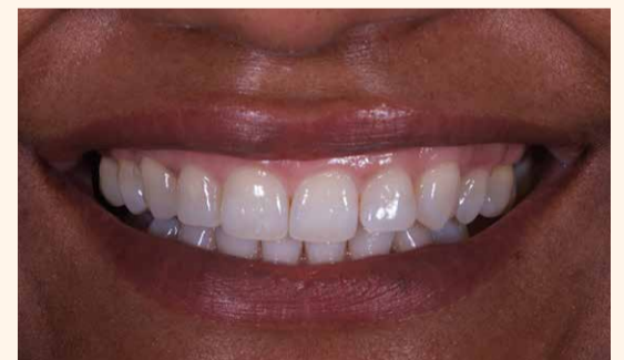
Figure 6: Patient's smile at the 2-year recall; dental bleaching, increased clinical crown size, coral-pink gingiva, all contribute to a healthy, aesthetic smile

applied more parallel to the tooth, with the unit's power settings at 3W 75Hz, with water and air settings 50