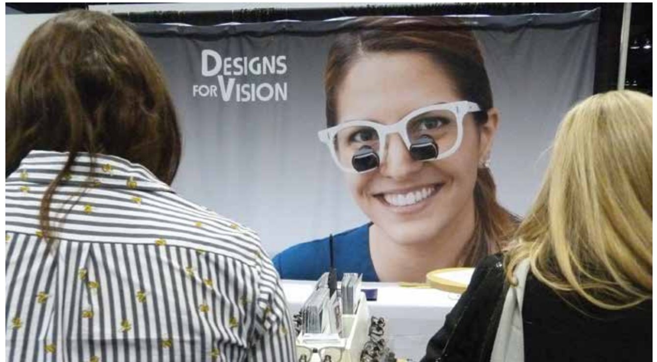
Check out the ultralight and ultra-bright headlights and other eyewear in the Designs for Vision booth (No. 1208).