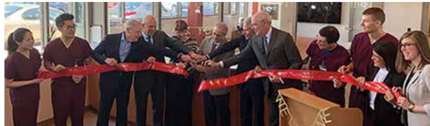
A ribbon cutting marks the opening of the Stephen Klein Wellness Center in Philadelphia.