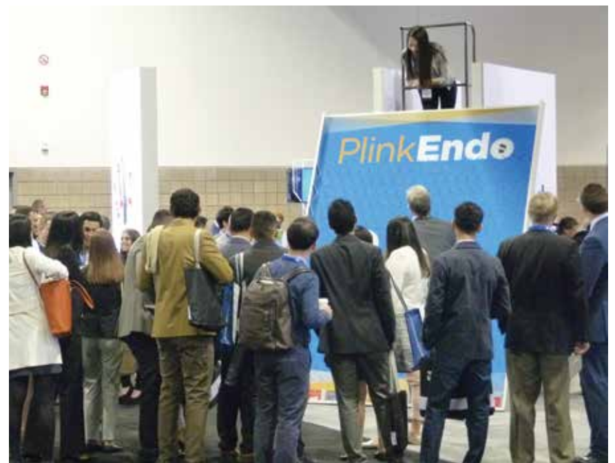
Collect up to four plinko chips at the Dentsply Sirona Endo booth (No. 509) and try your chances at a variety of prizes, including a Mavic Air Camera Drone.

If you go through the various stations in the Dentsply Sirona Endo booth (No. 509), you can collect up to four plinko chips to use on the booth's giant "PlinkEndo" board. Everybody wins