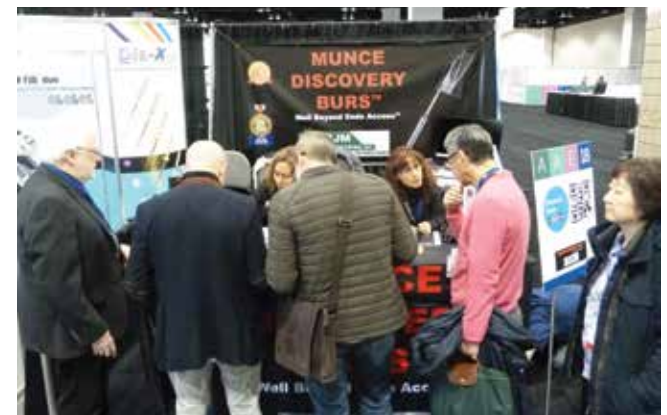
The counter at the Munce Discovery Burs booth (No. 726) is typically busy Wednesday morning.