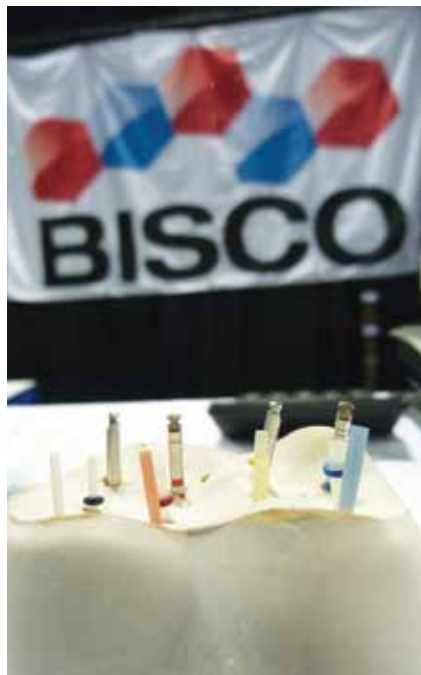
Feel free to handle the D.T. Light-Post Illusion X-RO Radiopaque Translucent Fiber Post System in the Bisco booth (No. 621).