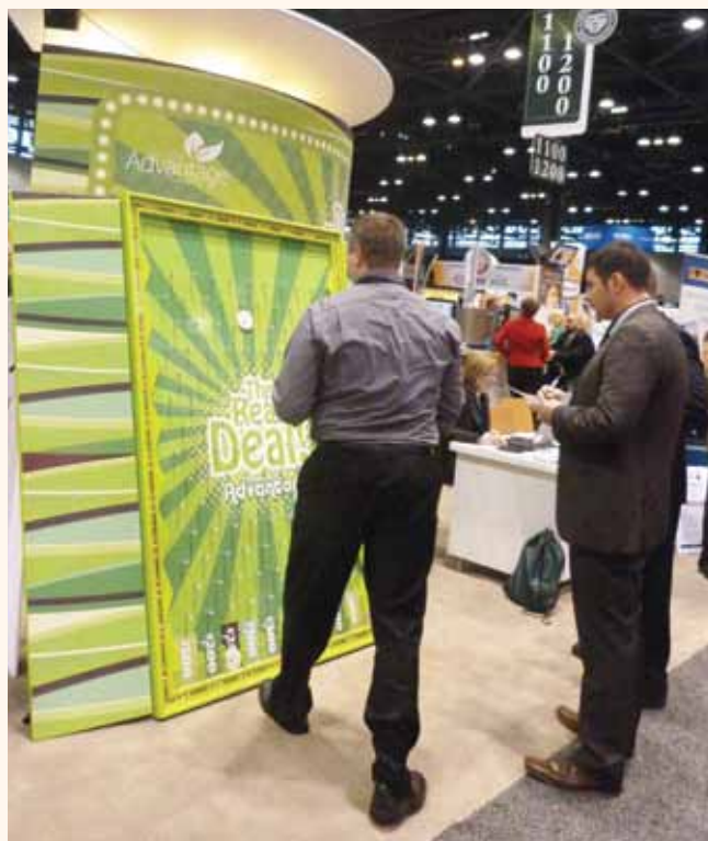
Information and games await you at the Patterson Dental booth (No. 1016) here at the Chicago Midwinter. While you're at the booth today, ask for a pass to the third annual Midwinter Madness, the 2013 dental convention after party at Enclave, 220 W. Chicago Ave. The pass is good for your whole group, and the event goes from 8 to 11 tonight.