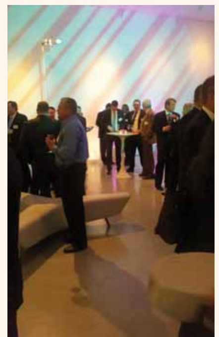
Premiere Dental celebrates 100 years at a Thursday evening celebration in Chicago.