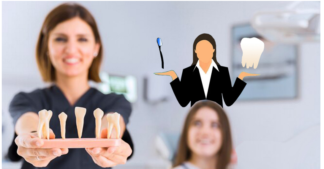
Creative DT Pakistan

Women in dentistry are making significant contributions across public and private sectors. From establishing clinics to engaging in research and academia, they play a crucial role in expanding access to oral healthcare countrywide, especially in rural areas, where healthcare facilities are often scarce. The presence of female dentists encourages more women to seek treatment, thereby creating a more inclusive healthcare environment.