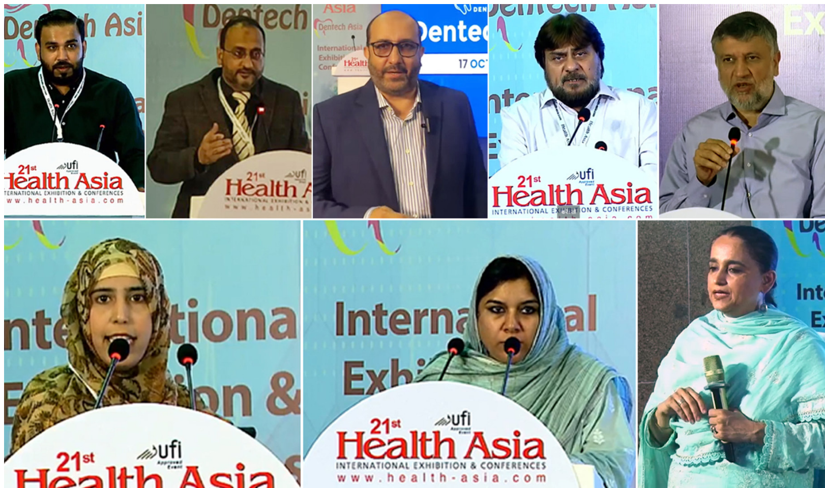
Notable speakers delivered insightful presentations at the Dentech Asia Conference held at the Expo Centre Karachi.

KARACHI: The 21st Health Asia International Exhibition and Conference at the Expo Centre Karachi also featured "Dentech Asia" that provided an opportunity to dental professionals to explore the latest advancements in the field by attending expert lectures, live demonstrations, and in-depth discussions and improve dental practices and patient care.