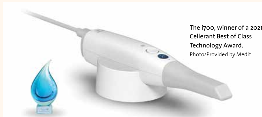
The i700, winner of a 2021 Cellerant Best of Class Technology Award.