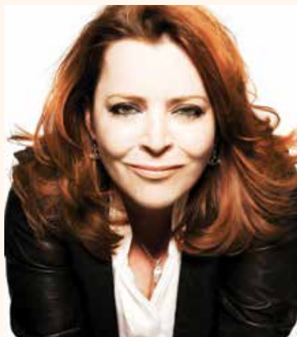
Comedian Kathleen Madigan will be featured at the Hinman Dental Meeting's keynote session in March.