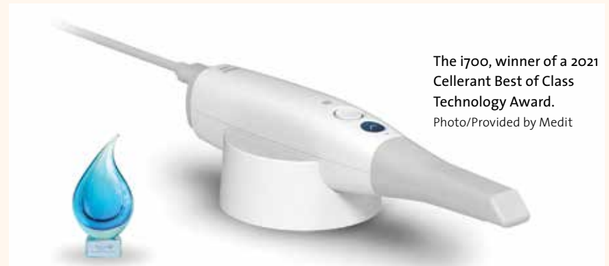
The i700, winner of a 2021 Cellerant Best of Class Technology Award.