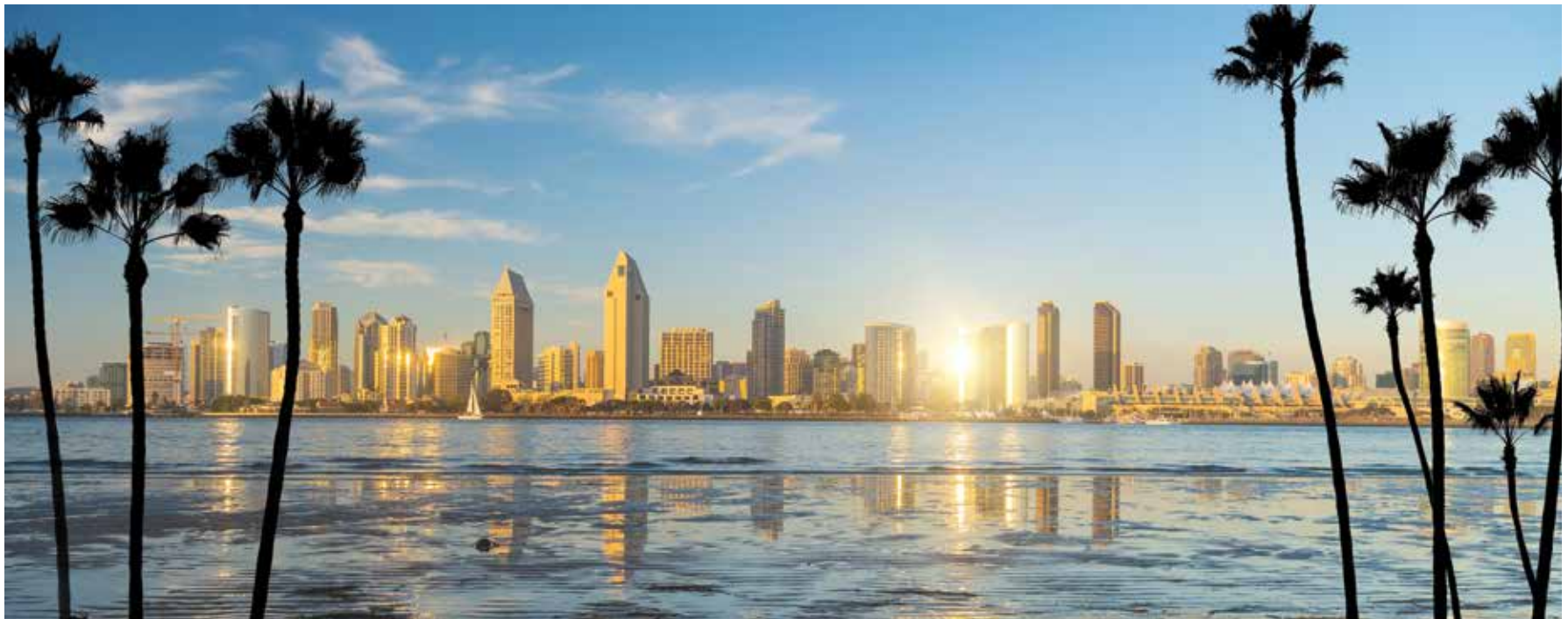
The 2022 AO Annual Meeting will return live and in-person from Feb. 24 to 26 and will take place at the San Diego Convention Center.