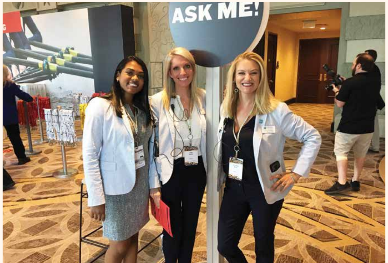
It's all smiles at a past year's Florida Dental Convention. This year's meeting features cutting-edge education, social events and a packed exhibit hall.

Do you have general comments or criticism you would like to share? Is there a particular topic you would like to see articles about in Dental Tribune? Let us know by sending an email to k.colker@dental-tribune.com . We look forward to hearing from you!