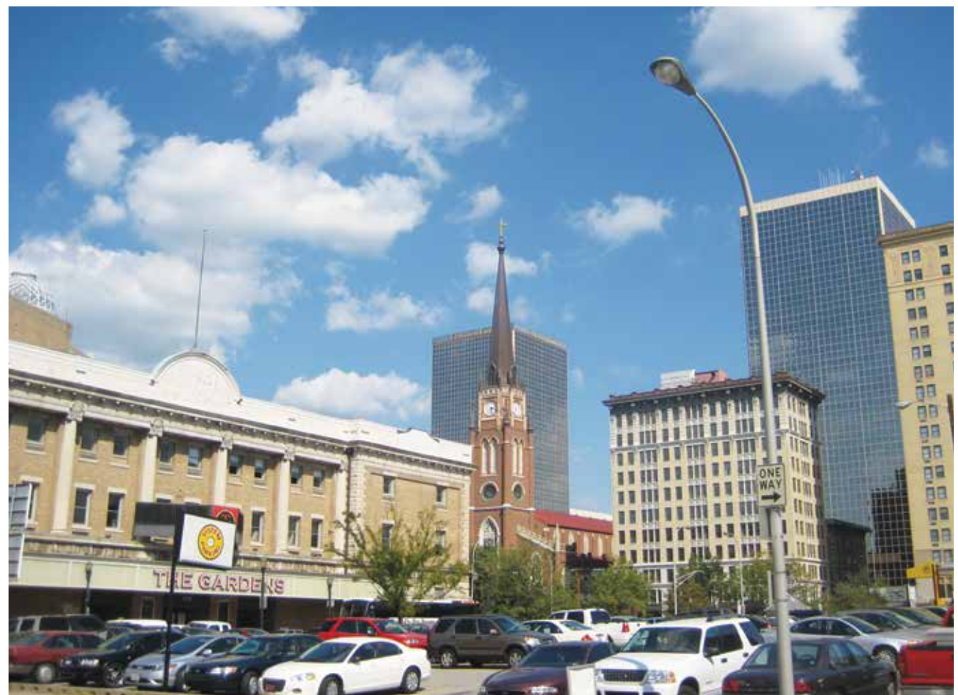
Louisville is the largest city in Kentucky. It was founded in 1778 by George Rogers Clark and is named after King Louis XVI of France, making Louisville one of the oldest cities west of the Appalachian Mountains. This year it is also the host city of ADHA22.