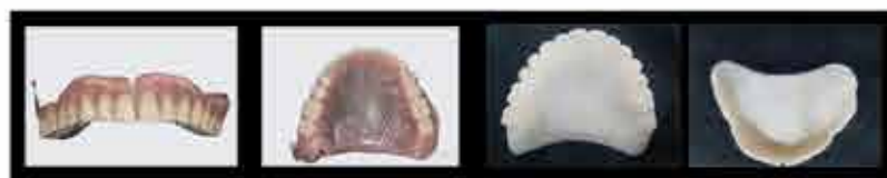
Figures 7-8. The previously used maxillary complete denture required duplication due to a fracture. The patient's complete denture was scanned using the Medit i700 then printed using a 3D printer.

In addition to the prosthetic restoration of implants, scanning dentures with intraoral scanners to duplicate existing dentures can reduce total treatment time and the number of visits.