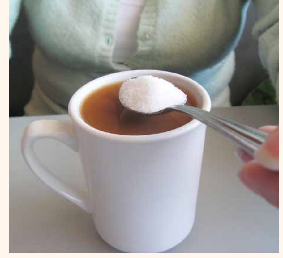
Find simple visuals and messages to help talk with patients about reducing and eliminating sugar-sweetened beverage consumption in the May issue of the Journal of the California Dental Association.

The Journal of the California Dental Association is an award-winning, peer-reviewed scientific publication that keeps dentists up to date about scientific advances, business management strategies and new products.