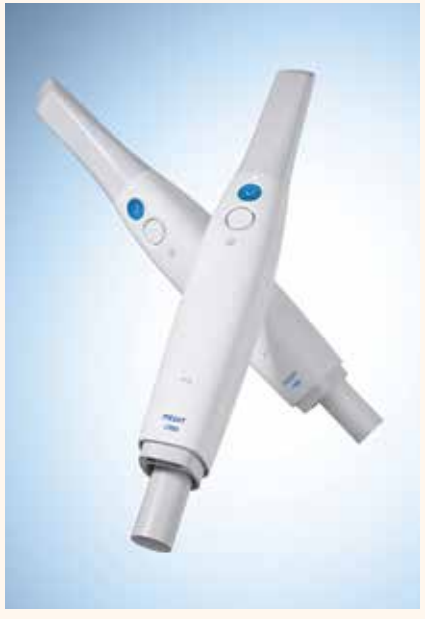
The i700 intraoral scanner by Medit is now wireless.

Free from wires, the light, weight-balanced i700 wireless offers a smooth and quick scanning experience utilizing mm wave-based next-generation wireless communication technology, according to the company. One battery offers one