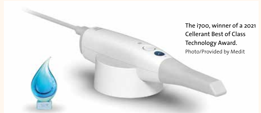
The i700, winner of a 2021 Cellerant Best of Class Technology Award.