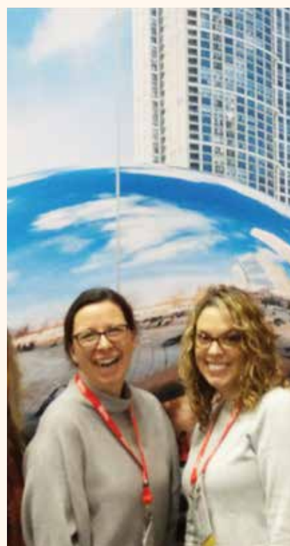
Attendees visit the Selfie Station during the 2019 AAP annual meeting. The AAP's 107th Annual Meeting, taking place in Miami Beach, offers four days of C.E. programming, including symposiums, lectures and hands-on workshops.