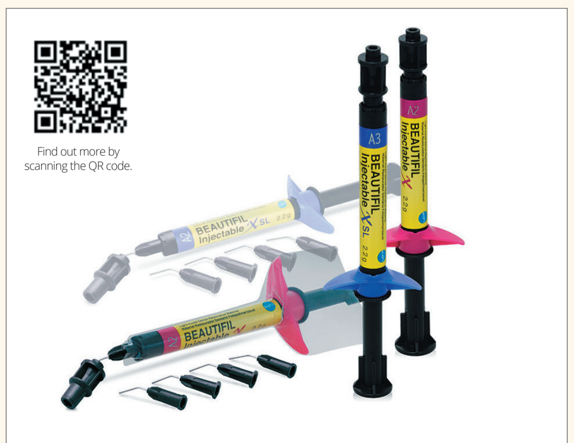
Beautiful Injectable X

SHOFU DENTAL ASIA-PACIFIC PTE LTD 10 Science Park Road, #03-12 The Alpha Singapore Science Park II Singapore 117684 Tel: (65) 6377 2722 Fax: (65) 6377 1121 E-mail: mailbx@shofu.com.sg Web: www.shofu.com.sg