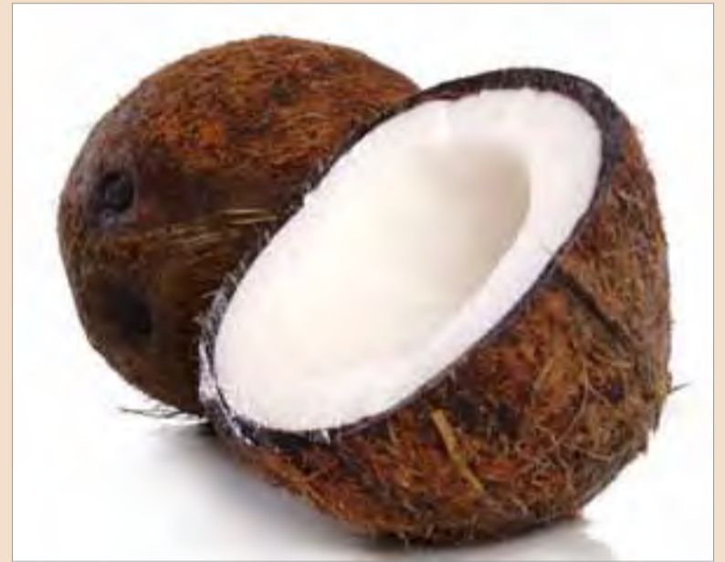
Coconut oil could help fight tooth decay

The researchers in AIT's Bioscience Research Institute are presenting their work at the Society for General Microbiology's autumn conference at the University of Warwick. DT