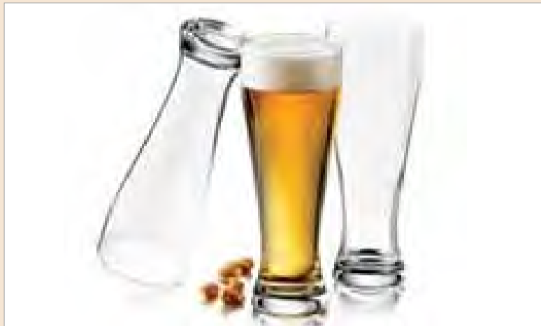
Scientists have known for 30 years about alcohol and cancer

Scientists have known for 30 years about the links between drinking alcohol and certain types of cancer, however there is new research explaining the effect the beverage has on people.