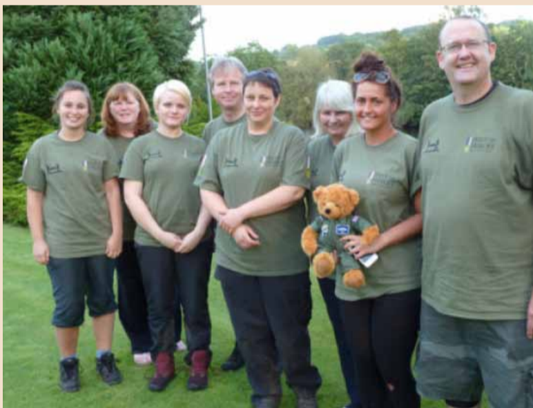
The team at Durham City smiles

A Durham based dental practice team completed a 26km walk along the historic Hadrian's Wall to raise thousands of pounds for Help for Heroes.