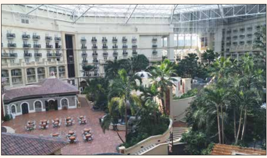
The atrium of the Gaylord Palms Resort & Convention Center in Orlando, which is the site of this year's Florida Dental Convention, running from June 23 to June 25.