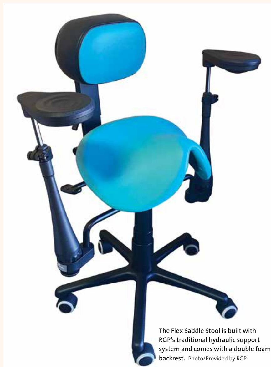
The Flex Saddle Stool is built with RGP's traditional hydraulic support system and comes with a double foam backrest.

You can also visit rgpergo.com to learn more.