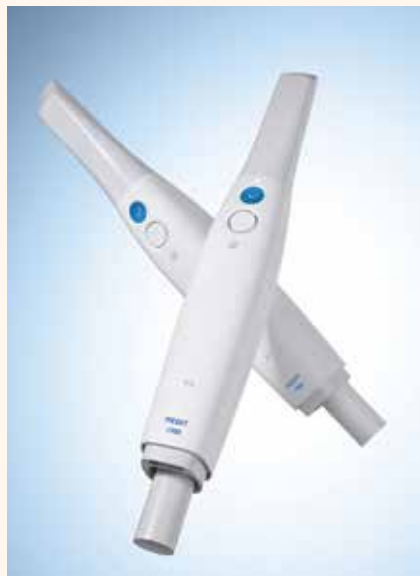
The i700 intraoral scanner by Medit is now wireless.

Free from wires, the light, weight-balanced i700 wireless offers a smooth and quick scanning experience utilizing mm wave-based next-generation wireless communication technology, according