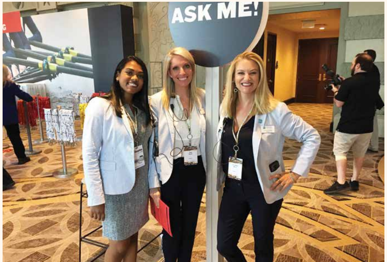
It's all smiles at a past year's Florida Dental Convention. This year's meeting features cutting-edge education, social events and a packed exhibit hall.