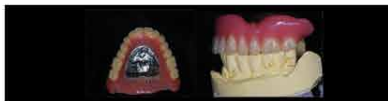
Figure 12. Final complete denture.

Figures 9-11. The final impression, vertical dimension, and occlusal relationship were acquired at once without the wax rim stage by using a duplicate denture.