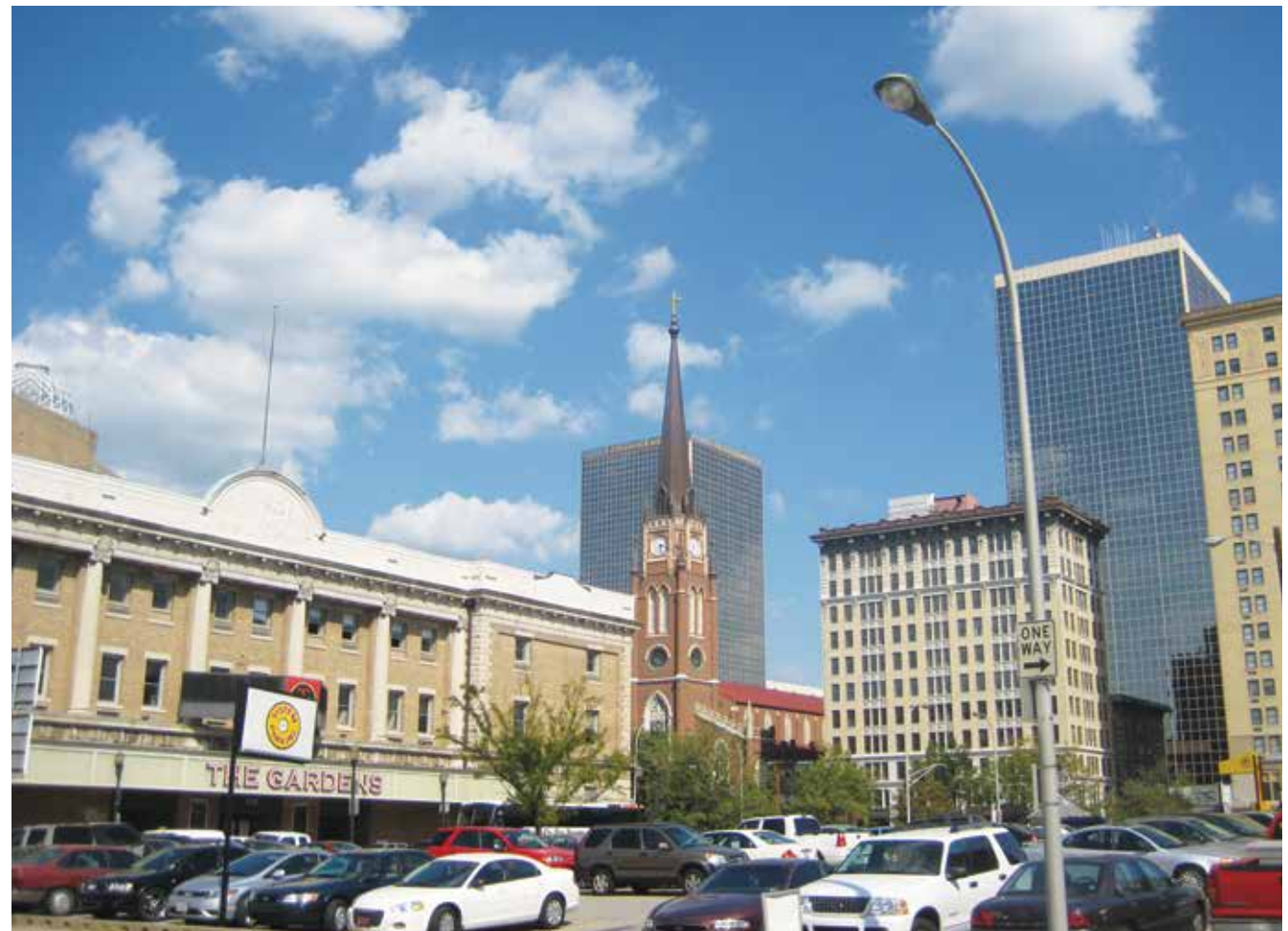
Louisville is the largest city in Kentucky. It was founded in 1778 by George Rogers Clark and is named after King Louis XVI of France, making Louisville one of the oldest cities west of the Appalachian Mountains. This year it is also the host city of ADHA22.