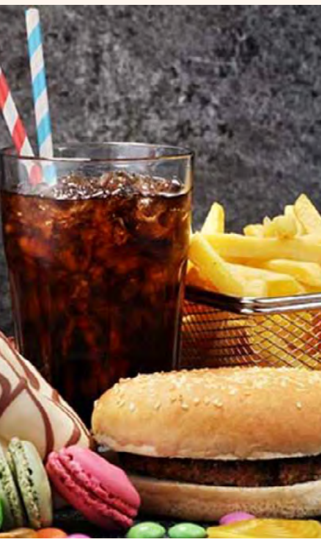
In a move that is the first of its kind in Australia, the Queensland government has announced a ban on the promotion of unhealthy food and drinks on the advertisement spaces it owns.

BRISBANE, Australia: An unhealthy diet can be a contributing factor to poor oral and general health, and advertising plays a key role in this regard. Seeking to curb this, the Queensland government has announced a ban on the promotion of unhealthy food and drinks on the advertisement spaces it owns. The move is the first of its kind by an Australian state.