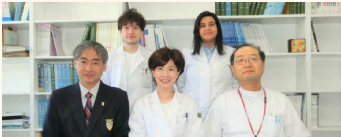
Scientists from China and the US have discovered that hydration is the key to pandas’ teeth lasting a lifetime.

HIROSHIMA, Japan: Researchers have recently developed a novel treatment to improve the quality of sleep for patients who suffer from mild to moderate obstructive sleep apnoea (OSA). Using 3-D imaging of the airways with the patients su-