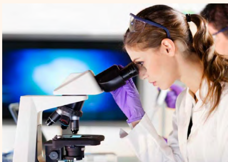
The findings of a new study could help decrease high oral cancer mortality in developing countries.

The study was conducted by researchers from the University of Otago in New Zealand and the Indian Statistical Institute (ISI) in Kolkata. The research team recruited 16 oral cancer patients in India who either smoked or chewed tobacco or had mixed habits, and took samples of their tumours and adjacent tissue. After isolating the DNA in the samples, the researchers discovered regions with altered epigenetic profiles in tumour cells compared with adjacent cells.