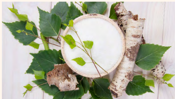
DuPont Nutrition & Health is the first company in South Korea to receive re-approval for xylitol health claims.

CHEONGJU, South Korea: South Korea's Ministry of Food and Drug Safety has issued a re-approval of the health claim that consumers from 3 to 80 years old of the sweetener XIVIA Xylitol have a reduced risk of dental caries. The manufacturer, DuPont Nutrition & Health,