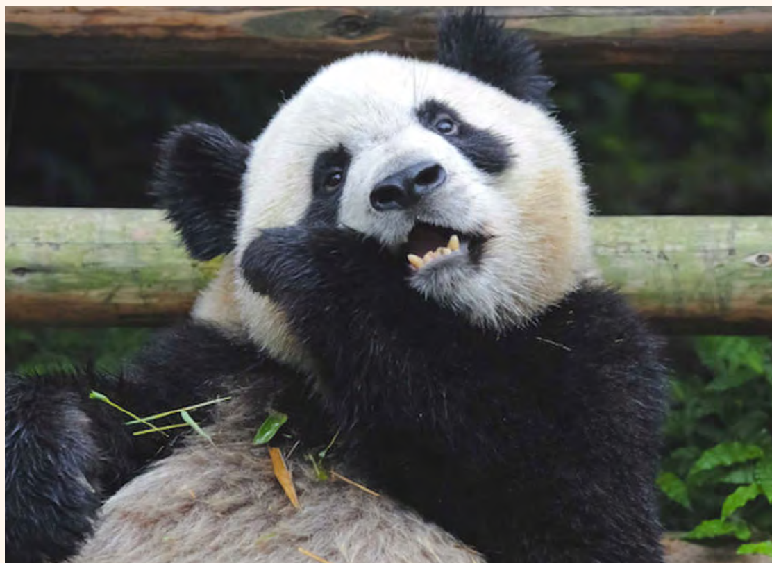
Scientists from China and the US have discovered that hydration is the key to pandas’ teeth lasting a lifetime.

The ingenious design of the panda’s tooth enamel, which has to withstand a daily diet of bamboo—a ma-