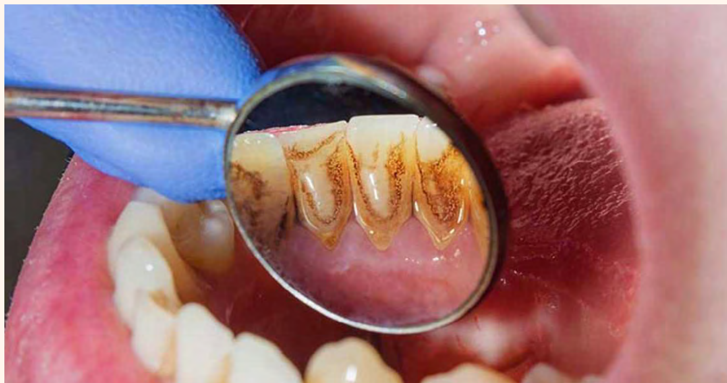
Researchers in Japan have developed a new method to treat periodontitis that they believe will be faster, cheaper and more effective than anything available today.

In a new approach to the treatment of periodontitis, the researchers transplanted stem cells from healthy mini pigs to those who had periodontal defects and, by doing so successfully, overcome the shortcomings that can be associated with autologous stem cell treatments. By using this mini pig periodontal