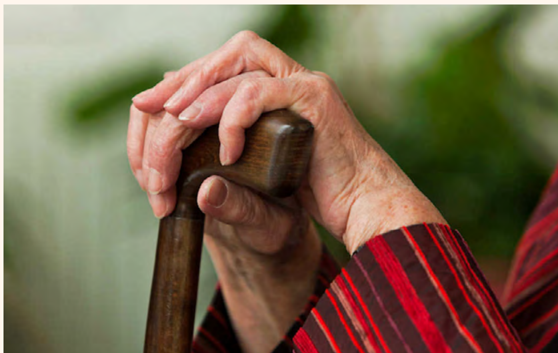
New research shows that elderly people who suffer from frailty are substantially more prone to issues with their oral health.

The study, titled "Frailty, oral health and nutrition in geriatrics inpatients: A cross sectional study", was published online in Gerodontology on 12 March 2019 ahead of inclusion in an issue.