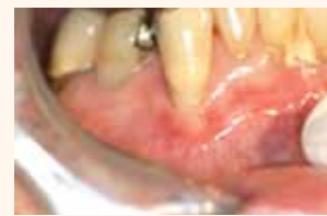
Fig. 7 One month post-op.