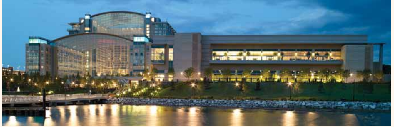
The Gaylord National Resort & Conference Center in National Harbor, Md., with its 18-story-tall climate-controlled atrium of glass and steel, is host site of the American Academy of Cosmetic Dentistry 28th Annual Scientific Session.