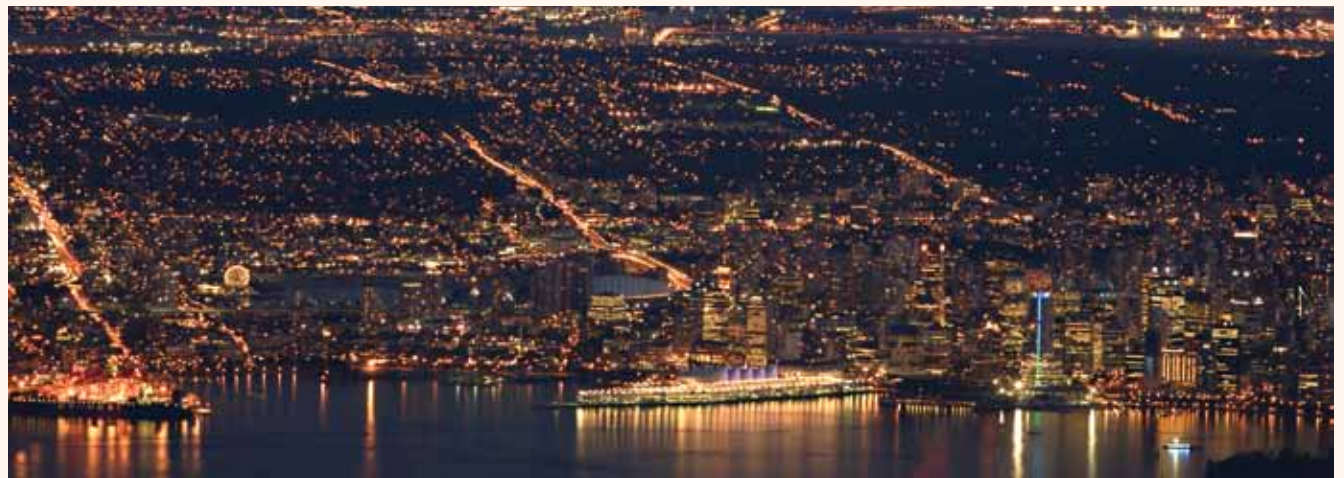
The Pacific Dental Conference combines all the excitement of Vancouver, named the world's 'Most Livable City' in 2011 by the Economist Intelligence Unit, with compelling educational opportunities for the entire dental team.

The Live Dentistry Stage is back on the exhibit hall floor, with demonstrations