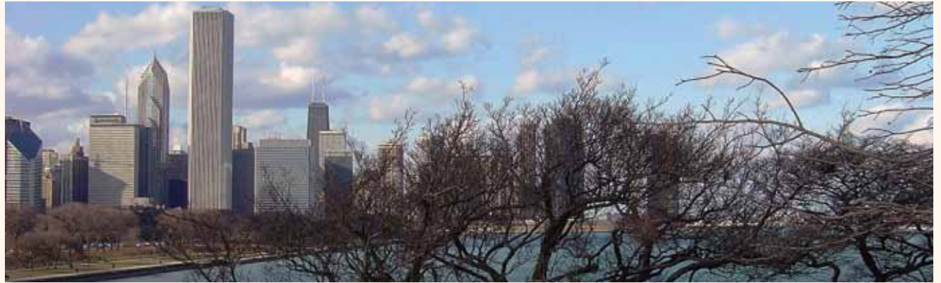
In addition to gaining access to hands-on courses and CE credit opportunities, attendees at the 2012 Chicago Dental Society's Midwinter Meeting get to explore one of the country's biggest and most fascinating cities.

New this year will be live treatment cases, broadcast on the exhibit floor each day of the meeting. Visitors to the meeting will be able to watch clinicians treat patients in a theater constructed on