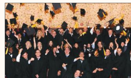
The traditional tossing of mortar boards celebrates newly conferred IADFE fellowships.

This year's fellowships will be awarded at the iconic Sanford-White-designed Harmonie Club at 4 East 60th St. (between Madison and Park avenues). Beginning at 6 p.m., fellowships will be presented to new members from across the globe, including Australia, New Zealand, France,