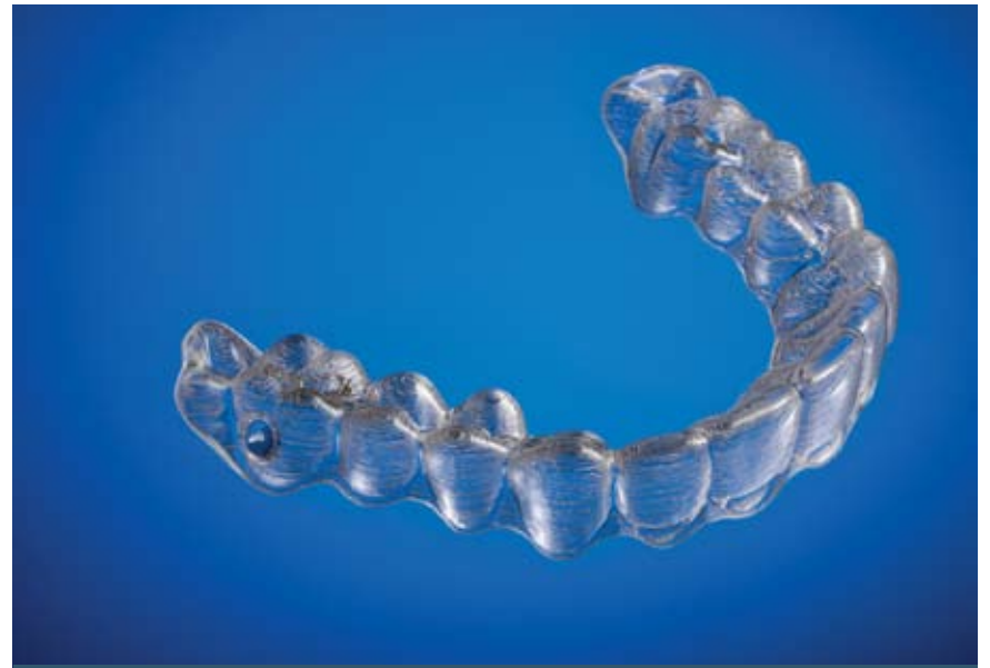
Invisalign Teen aligner with teen-specific features.