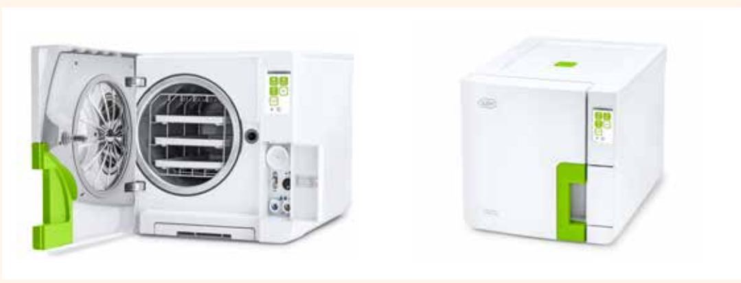
The \ type \ B \ sterilizer \ Lara: perfect \ ergonomics \ and \ functionality for \ incredible \ usability.