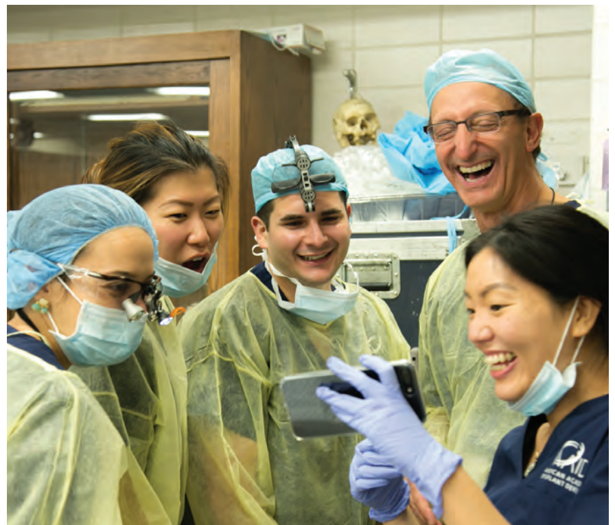
Dental implant teams are encouraged to attend the AAID annual conference together.

When you're not attending sessions, there are plenty of sights to see in Dallas, such as the Reunion Tower, Dealey Plaza and the West End. Add the Texas State Fair to your list of places to visit! It is an amazing experience, AAID staff asserts.