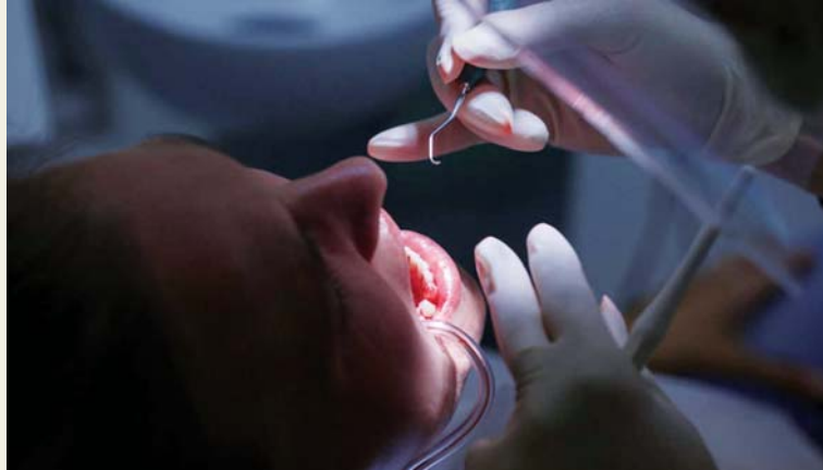
A new review study has concluded that patients with periodontal disease may have an increased risk of developing COVID-19-related respiratory complications.

by performing a scaling and root planing procedure on a patient with periodontal disease, we can lower IL-6 levels by, on average, 3 pg/ml," Molayem told Dental Tribune International.