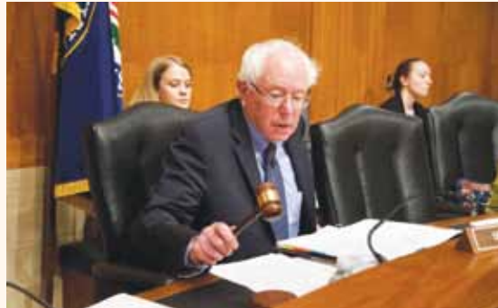
Sen. Bernard Sanders, I-Vt., chairman of the U.S. Senate Subcommittee on Primary Health and Aging, leads the hearing on "Dental Crisis in America: The Need to Expand Access."