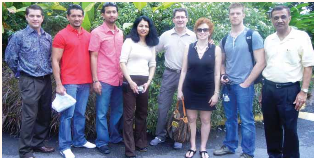
Participants at the AAIP/ADIS implant seminar, Kingston, Jamaica, March 12–16.