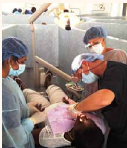
The AAIP/ADIS course is tax deductible and worth 35 hours of dental continuing education credits.