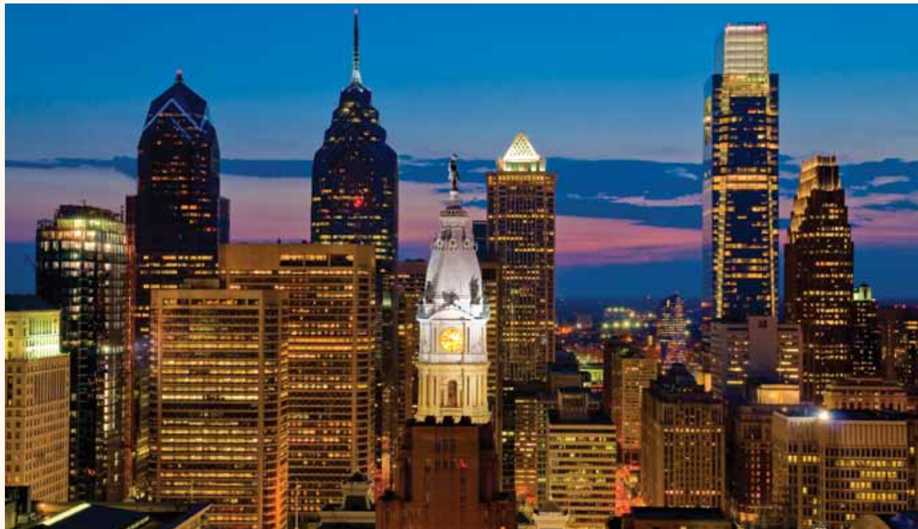
An evening sky view of Philadelphia highlights the contrast of new and old standing side by side. In the photo's center is the bronze statue of the city's founder, William Penn, sitting on top of the 511-foot-tall City Hall Tower with its lighted clock. The newest addition to the skyline, the Comcast Center on the right, is the tallest building between New York and Chicago.

Exhibit hall hours are 4:30 to 7:30 p.m. Thursday, June 21, with an all-attendee welcome reception from 5:30 to 6:30 p.m. The next day, Friday, June 22, the exhibit hall opens at 10 a.m. and closes at 6:30