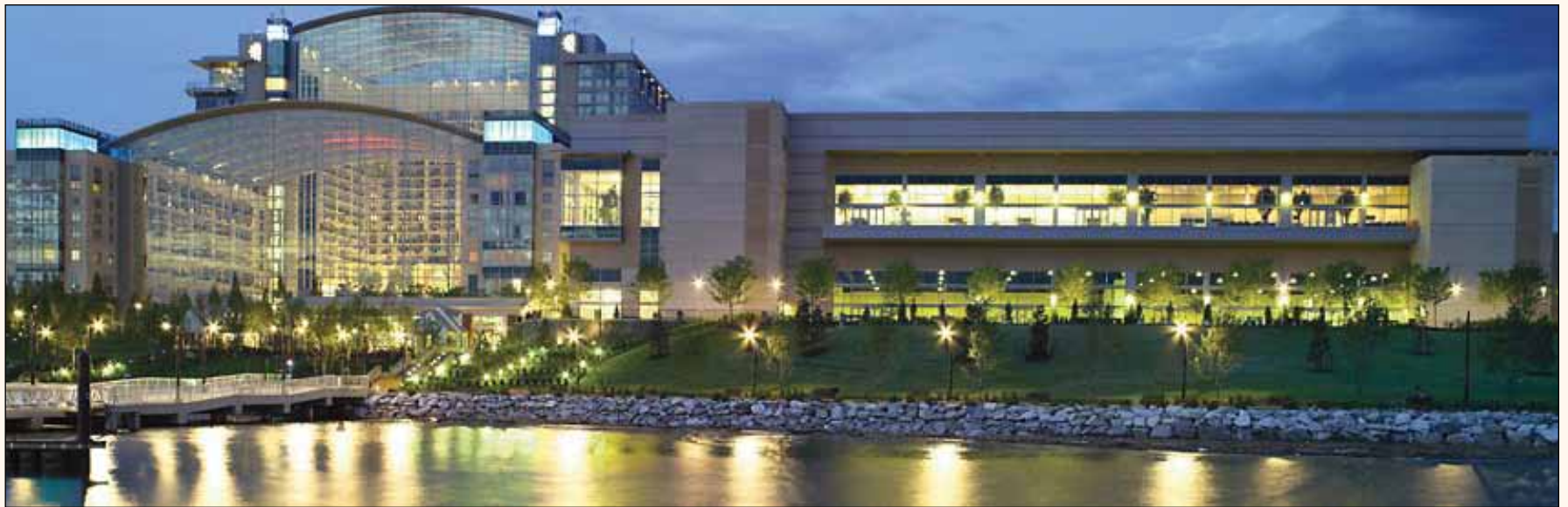
The Gaylord National Resort and Convention Center in National Harbor, Md., hosts the National Dental Association's centennial annual meeting from July 26–30.