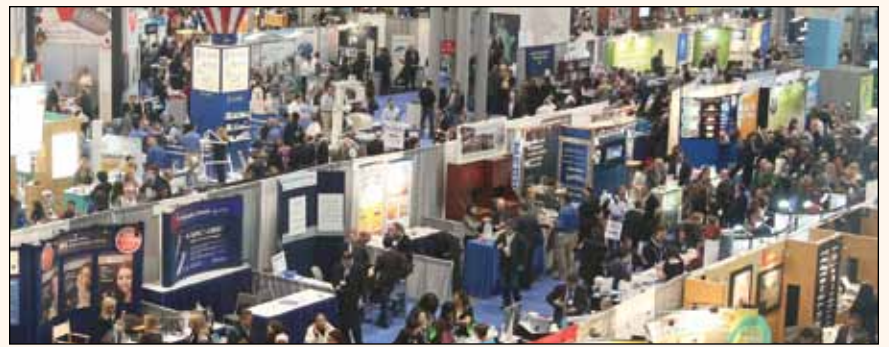
Unchanged: free registration. But new at the 2013 Greater New York Dental Meeting are three hands-on pavilions with lasers, CAD/CAM and cone-beam/CT/X-rays.

The GNYDM continues to offer a modern, high-tech free “live dentistry” arena daily from Sunday through Wednesday.