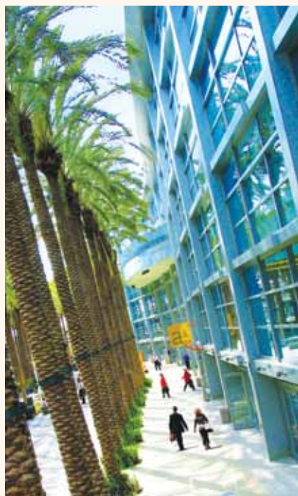
The Palm Court Plaza in front of the Anaheim Convention Center, location of CDA Presents: The Art and Science of Dentistry.

(Source: Greater New York Dental Meeting)