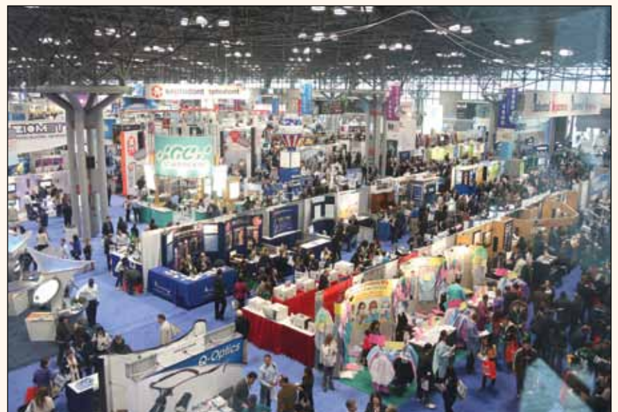
Changes for the 2013 Greater New York Dental Meeting include a redesigned exhibit floor that includes new technology pavilions and a dental laboratory exhibition.

The Greater New York Dental Meeting continues to offer a modern, high-tech, free “live dentistry” arena daily from Sunday through Wednesday. The interactive “live” program features top clinicians performing dental procedures on