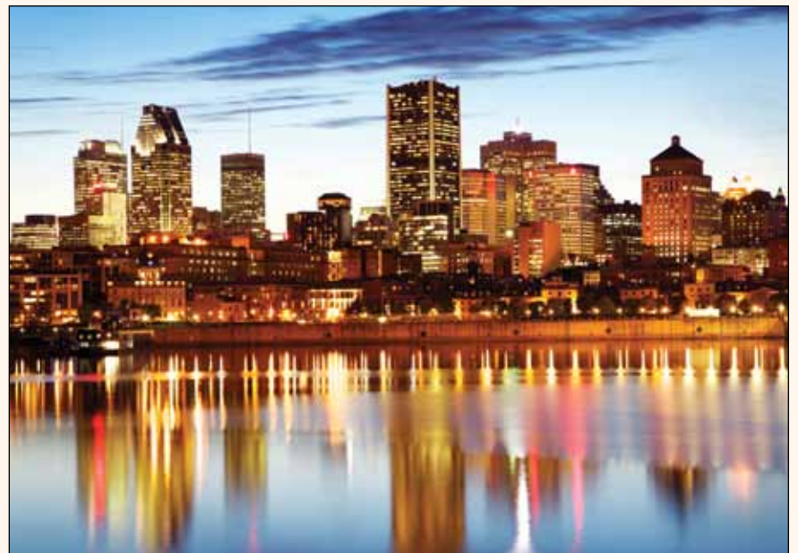
The Montréal skyline on a summer evening.