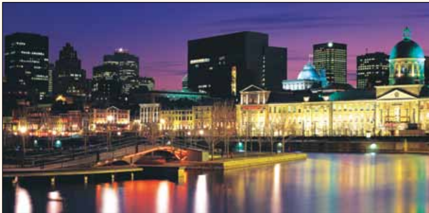
Old Port of Montréal, the backdrop to the Journées dentaires internationales du Québec.

tions on Thursday and Friday. Saturday’s “So You Think You Can Speak?” features 50-minute presentations by speakers who responded to the call for presentations and were accepted by the meeting’s scientific committee. The exhibit hall should be busy with more than 300 companies projected to fill approximately 600 booths. Exhibit hall hours are 8:30 a.m. to 6 p.m. on Thursday; 8:30 a.m. to 5:30 p.m. on Friday. Registration and lodging Special hotel rates are available to PDC attendees, with early booking recommended to ensure availability. Reservations can be made directly with conference hotels through the links on www.pdconf.com . Registration opens Oct. 15 with early bird rates for all members of the dental team. (Source: Pacific Dental Conference)