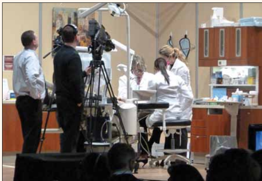
Four days of live dentistry in the exhibit hall are among the many highlights of the diverse educational opportunities at the Greater New York Dental Meeting.

The GNYDM is the largest dental congress and exhibition in the United States, registering 53,481 attendees from all 50 states and 130 countries in 2012.