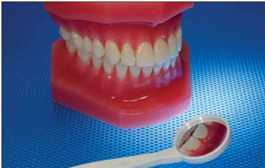
A recent study confirms that genetic testing can identify patients who have an increased inflammatory response to oral bacteria, which can significantly increase their risk for periodontitis and tooth loss.

Periodontitis initiation and progression is driven by two factors: bacterial plaque that initiates the disease and the body's inflammatory response to bacteria, which, when overly aggressive, can cause breakdown of the bone and tissue that support the teeth. This inflammatory response varies greatly within the