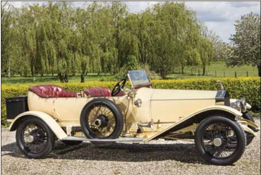
The 1913 ‘Silver Ghost’ London-to-Edinburgh Tourer was once the property of a pioneering French-American dentist who volunteered for the Red Cross during World War I.