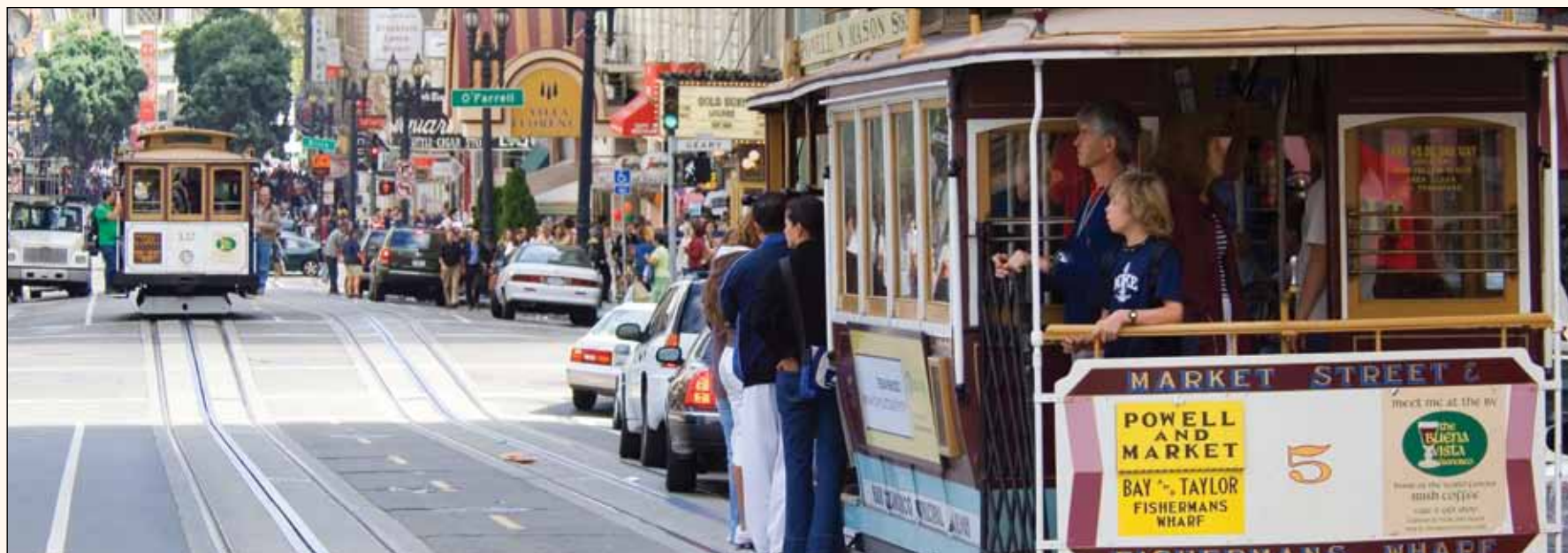
The iconic sights and sounds of San Francisco, including the world's only manually operated cable car system still running in a metro area, await attendees of CDA Presents The Art and Science of Dentistry, scheduled for Aug. 15–17 at the Moscone South Convention Center.