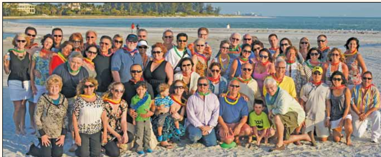
Attendees at the 2013 Smiles In The Sun Seminar, on the beach in Longboat Key, Fla.