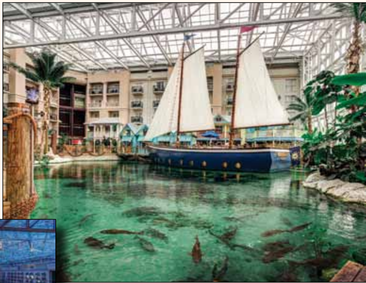
Host site for the 2013 American Association of Dental Office Managers conference is the Gaylord Palms Resort and Convention Center, which is known for its expansive atriums, each filled with lush vegetation, water features, meandering paths and a variety of dining and entertainment options.

industry. And in that spirit the association is dedicated to keeping the conference as eco-friendly as possible.