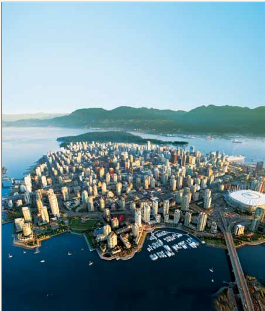
Vancouver, British Columbia, serves as host site of the Pacific Dental Conference, March 6–8.