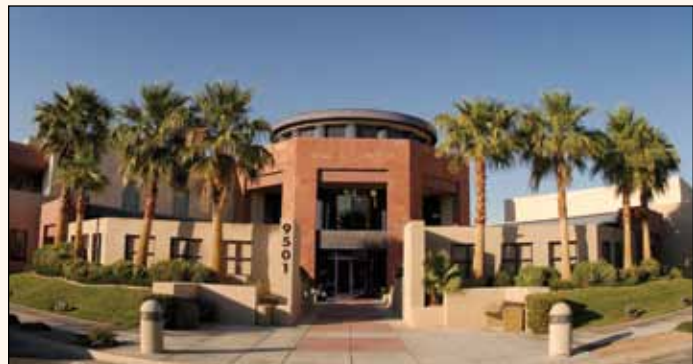
Las Vegas Institute for Advanced Dental Studies offers Core I, a three-day course for doctors and their teams.

That's why when you call, we will answer the phone, "LVI, where lives are changing daily!"